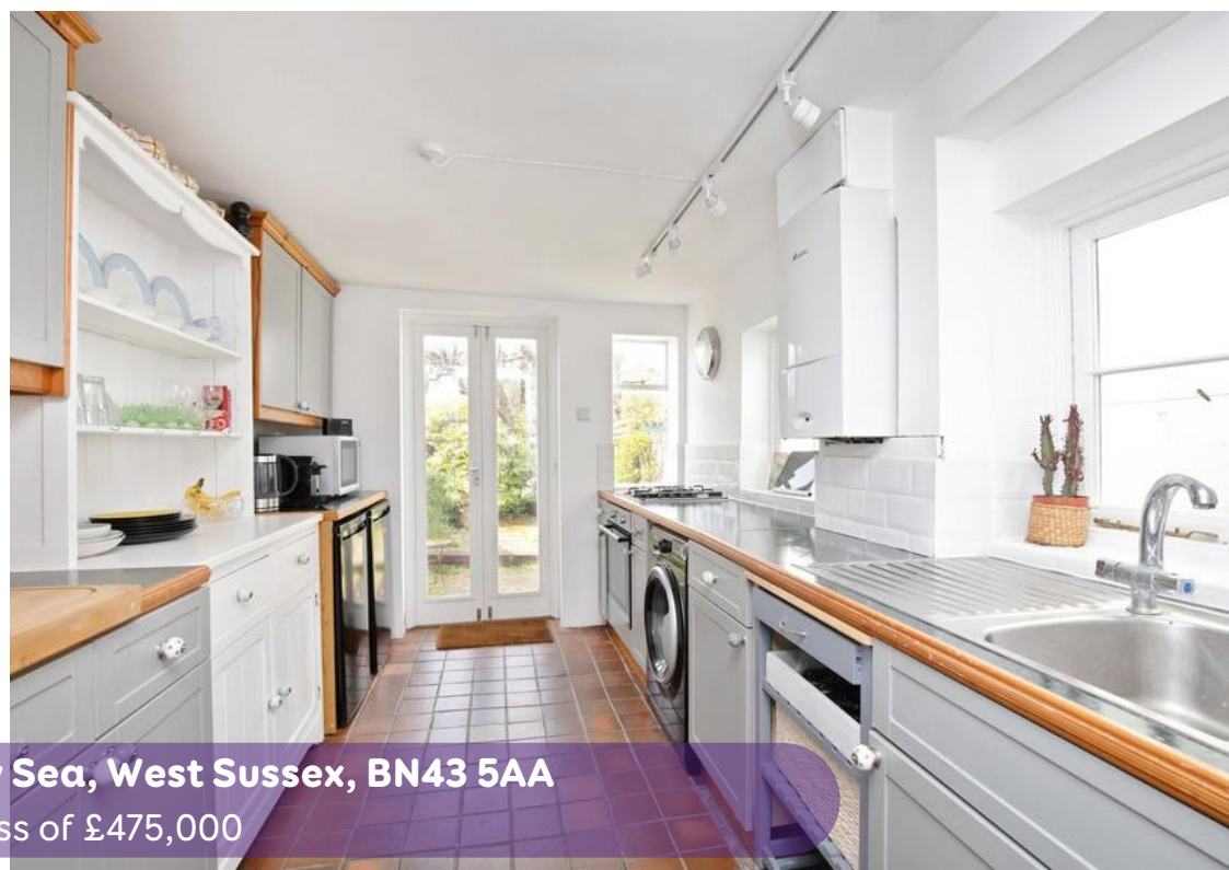
Queens Place, Shoreham by Sea, West Sussex, BN43 5AA Offers in Excess of £475,000