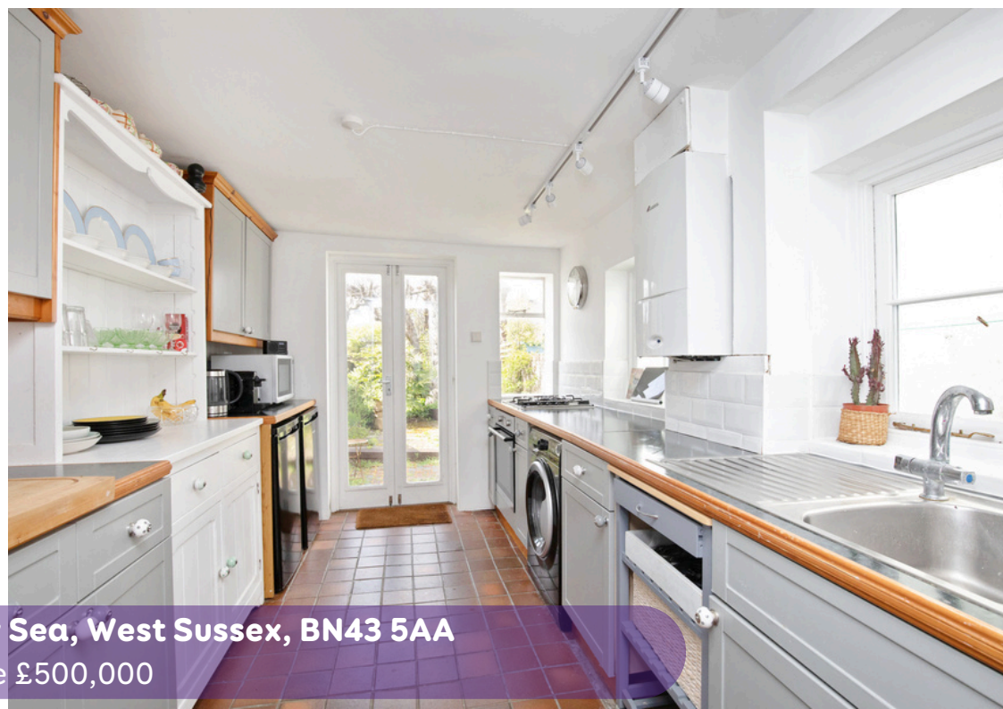
Queens Place, Shoreham by Sea, West Sussex, BN43 5AA Guide Price £500,000