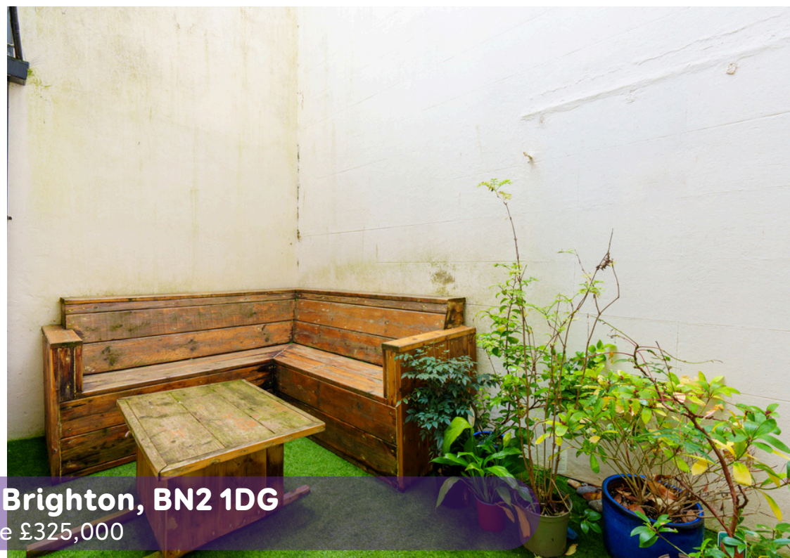
Portland Place, Brighton, BN2 1DG Asking Price £325,000