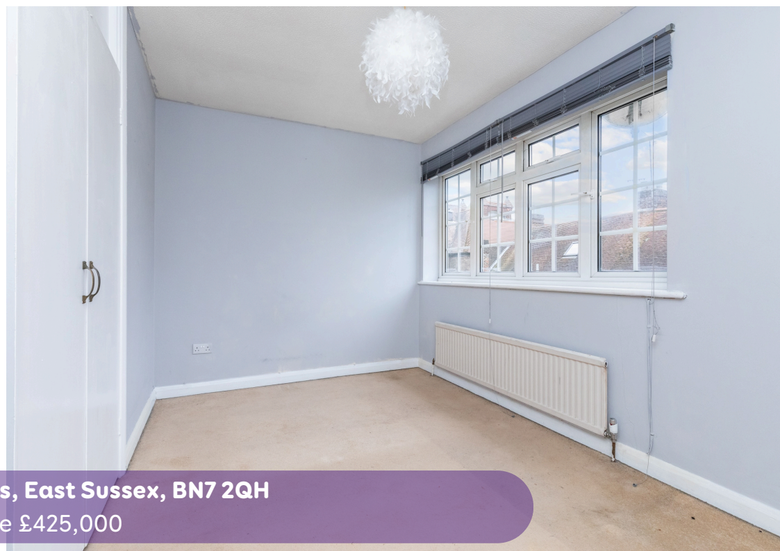
8 Edward Street, Lewes, East Sussex, BN7 2QH Asking Price £425,000