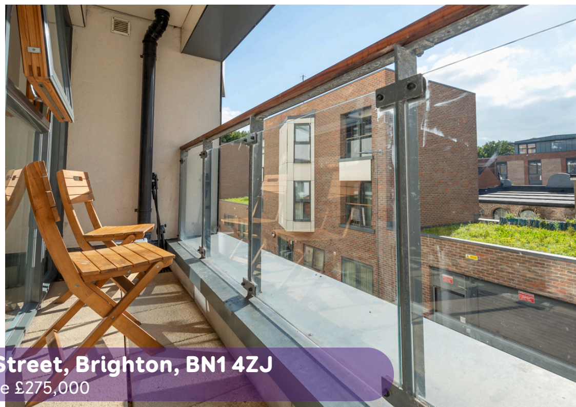
The Barrows, Francis Street, Brighton, BN1 4ZJ Asking Price £275,000