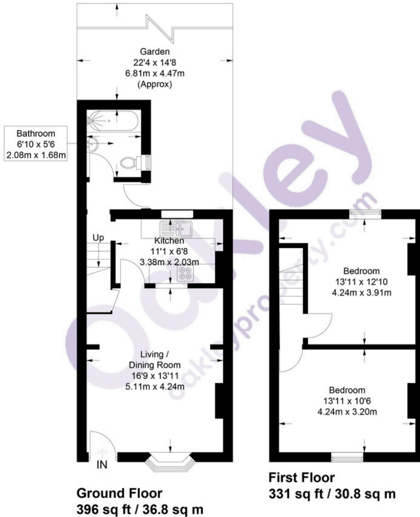
Illustration for identification purposes only, measurements are approximate, not to scale. © Oakley Property 2023