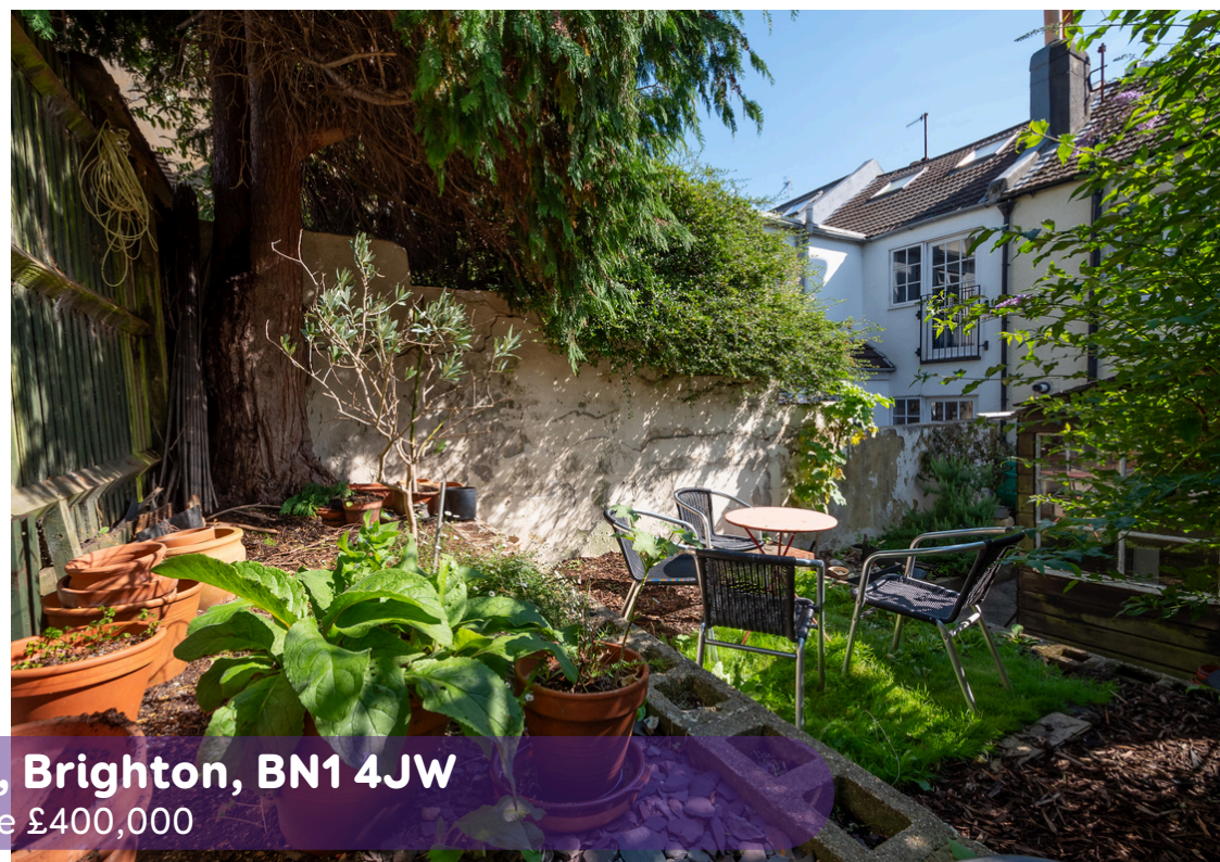
Kingsbury Street, Brighton, BN1 4JW Asking Price £400,000