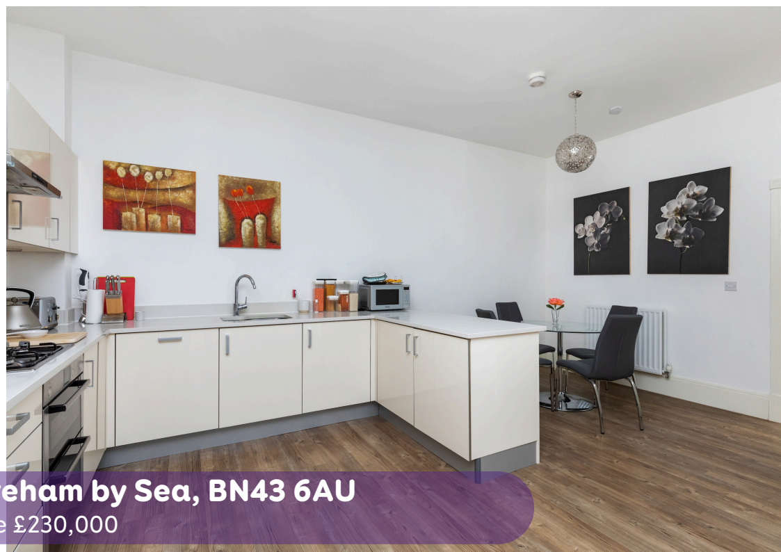
The Old Refectory, Shoreham by Sea, BN43 6AU Guide Price £230,000