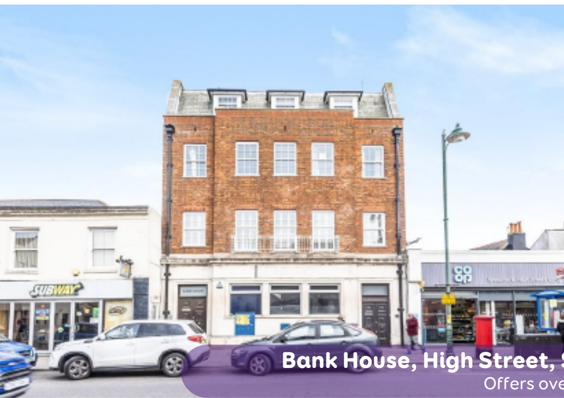
Bank House, High Street, Shoreham by Sea, BN43 5DA Offers over £350,000