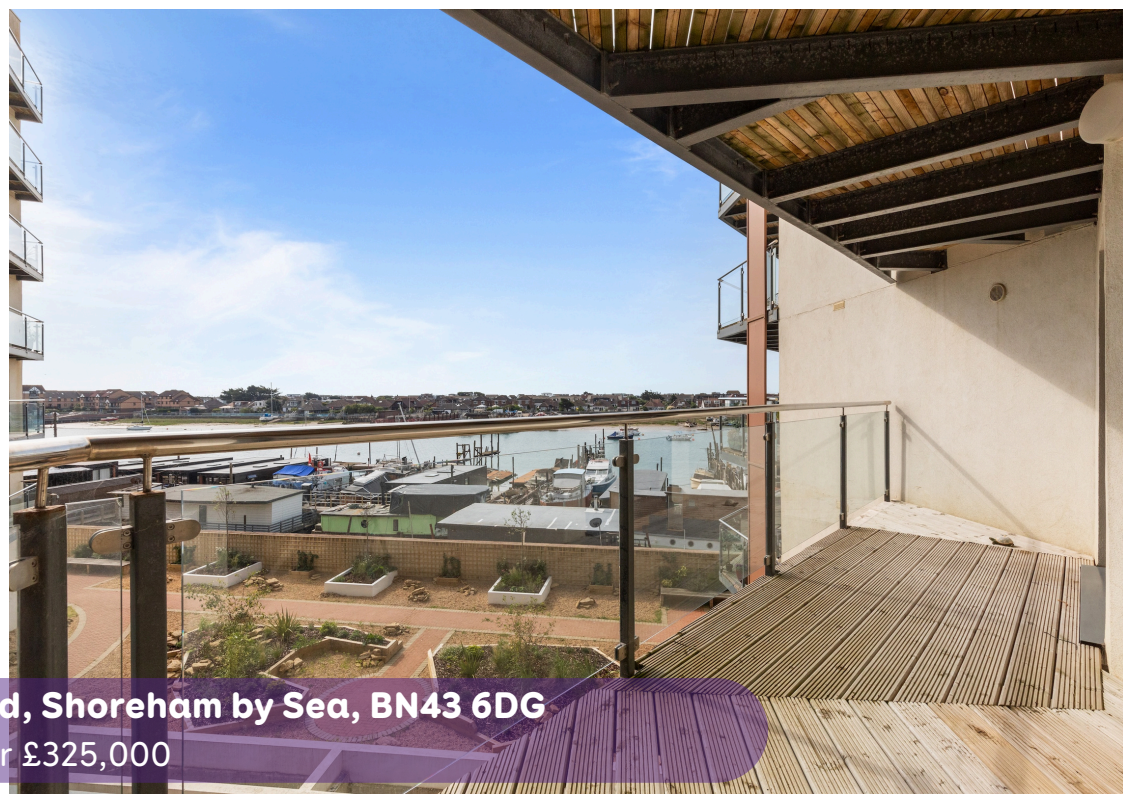
Mariner Point, Brighton Road, Shoreham by Sea, BN43 6DG Offers Over £325,000