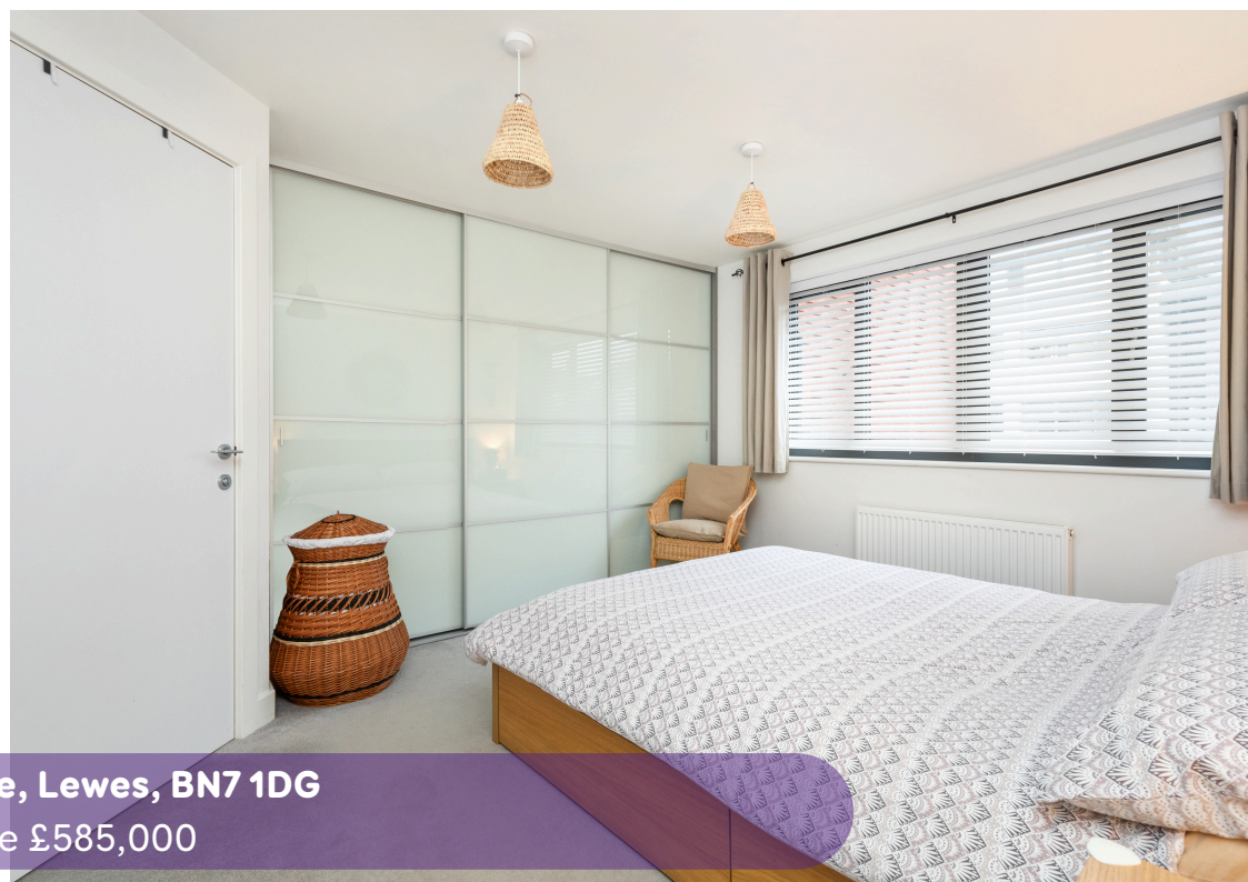
4 Flat 1, Bell Lane, Lewes, BN7 1DG Asking Price £585,000