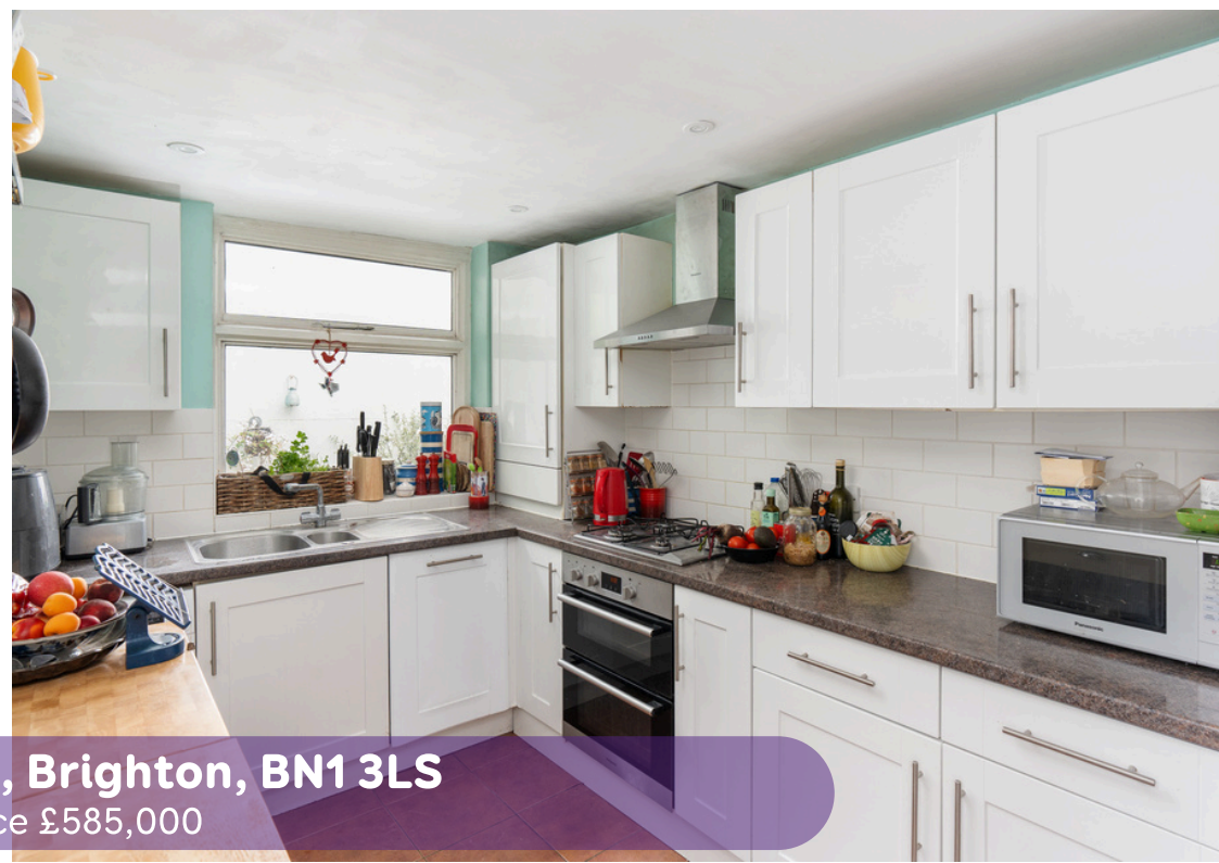
Guildford Street, Brighton, BN1 3LS Asking Price £585,000