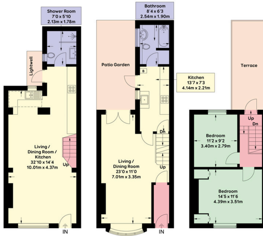
Lower Ground Floor 489 sq ft / 45.4 sq m