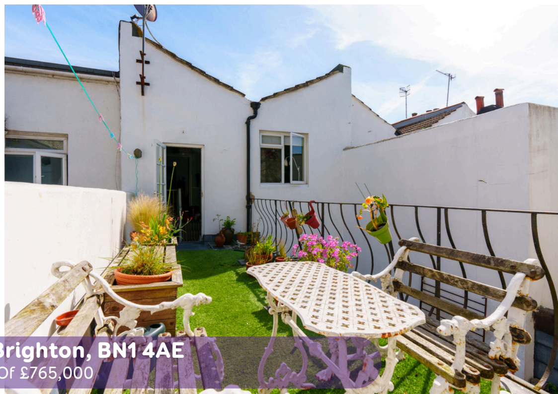
Blenheim Place, Brighton, BN1 4AE Asking Price Of £765,000