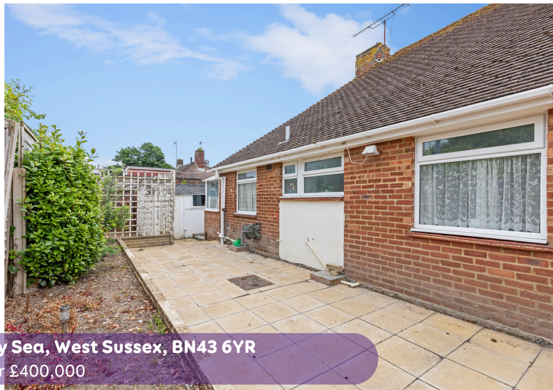
Ashcroft Close, Shoreham by Sea, West Sussex, BN43 6YR Offers Over £400,000