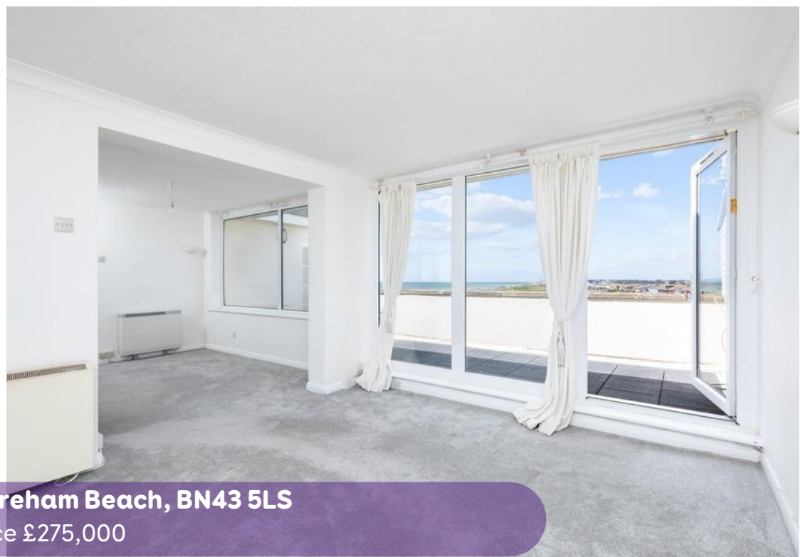
Widewater Court, Shoreham Beach, BN43 5LS Guide Price £275,000