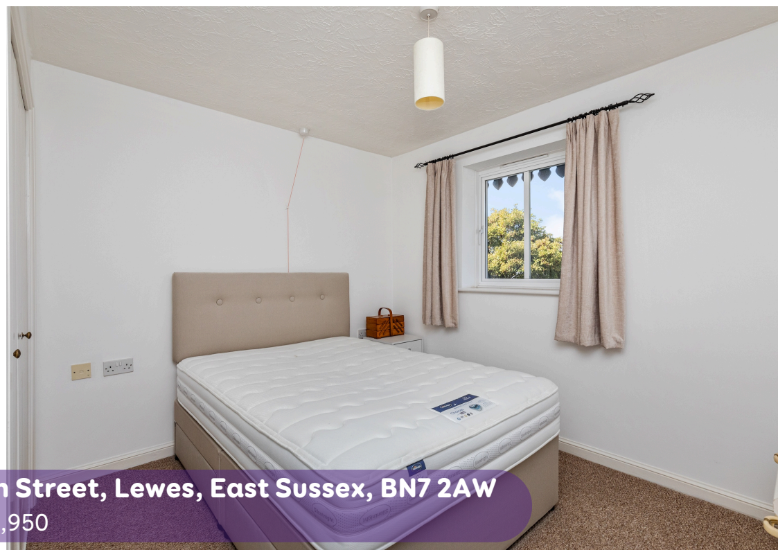
Flat 9, St. Thomas Court, Cliffe High Street, Lewes, East Sussex, BN7 2AW £179,950