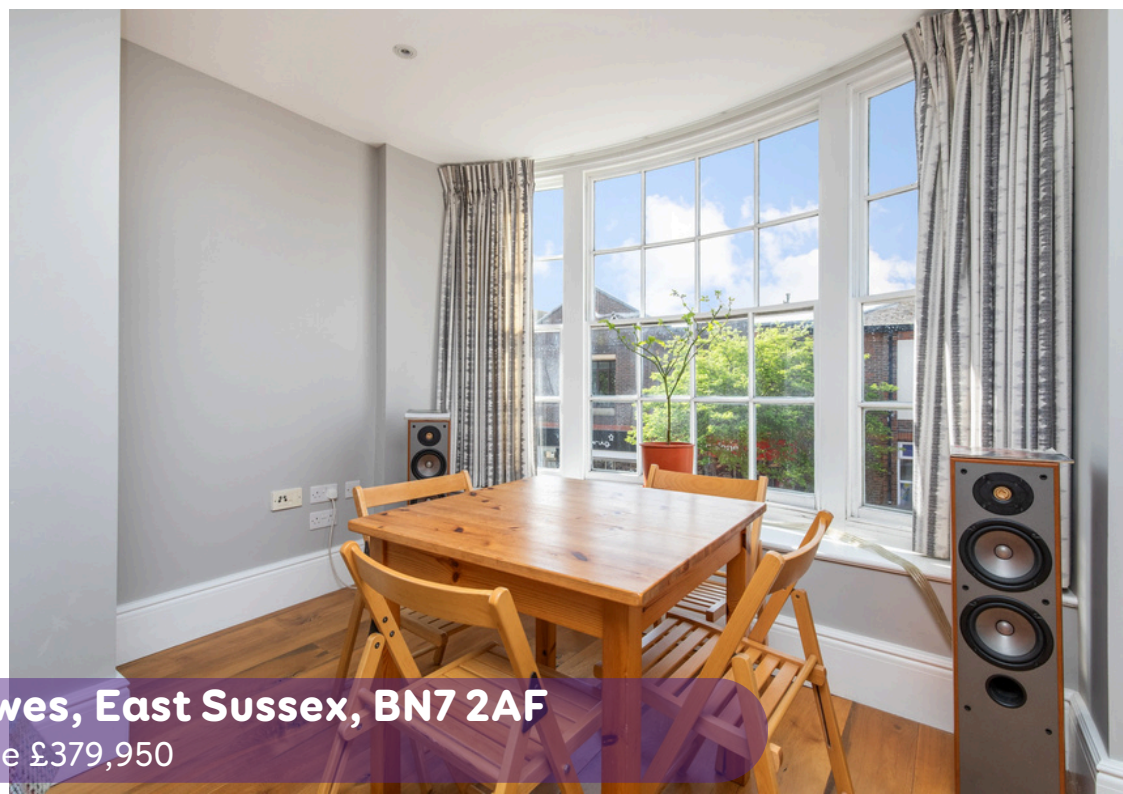
Flat 1 220 High Street, Lewes, East Sussex, BN7 2AF Asking Price £379,950