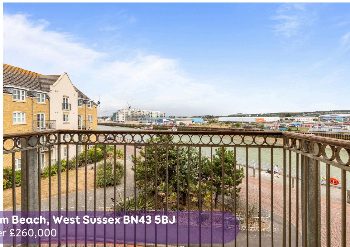
Newport, Sussex Wharf, Shoreham Beach, West Sussex BN43 5BJ Offers Over £260,000