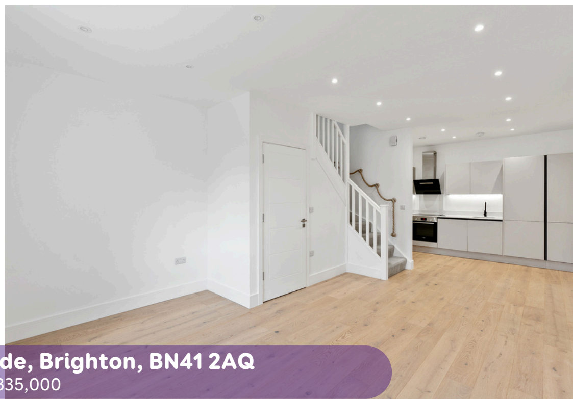
34 South Street, Portslade, Brighton, BN41 2AQ From £335,000