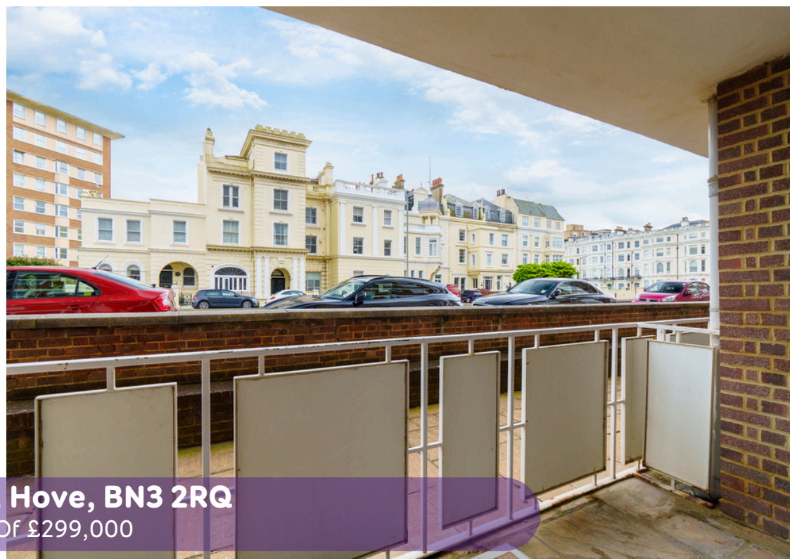
Albany Towers, Hove, BN3 2RQ Asking Price Of £299,000