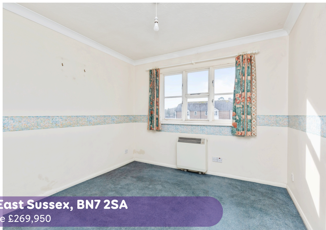
Court Road, Lewes, East Sussex, BN7 2SA Asking Price £269,950