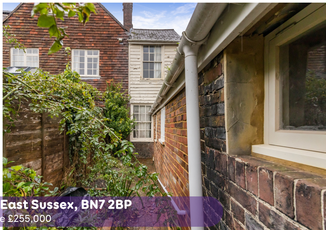
South Street, Lewes, East Sussex, BN7 2BP Asking Price £255,000