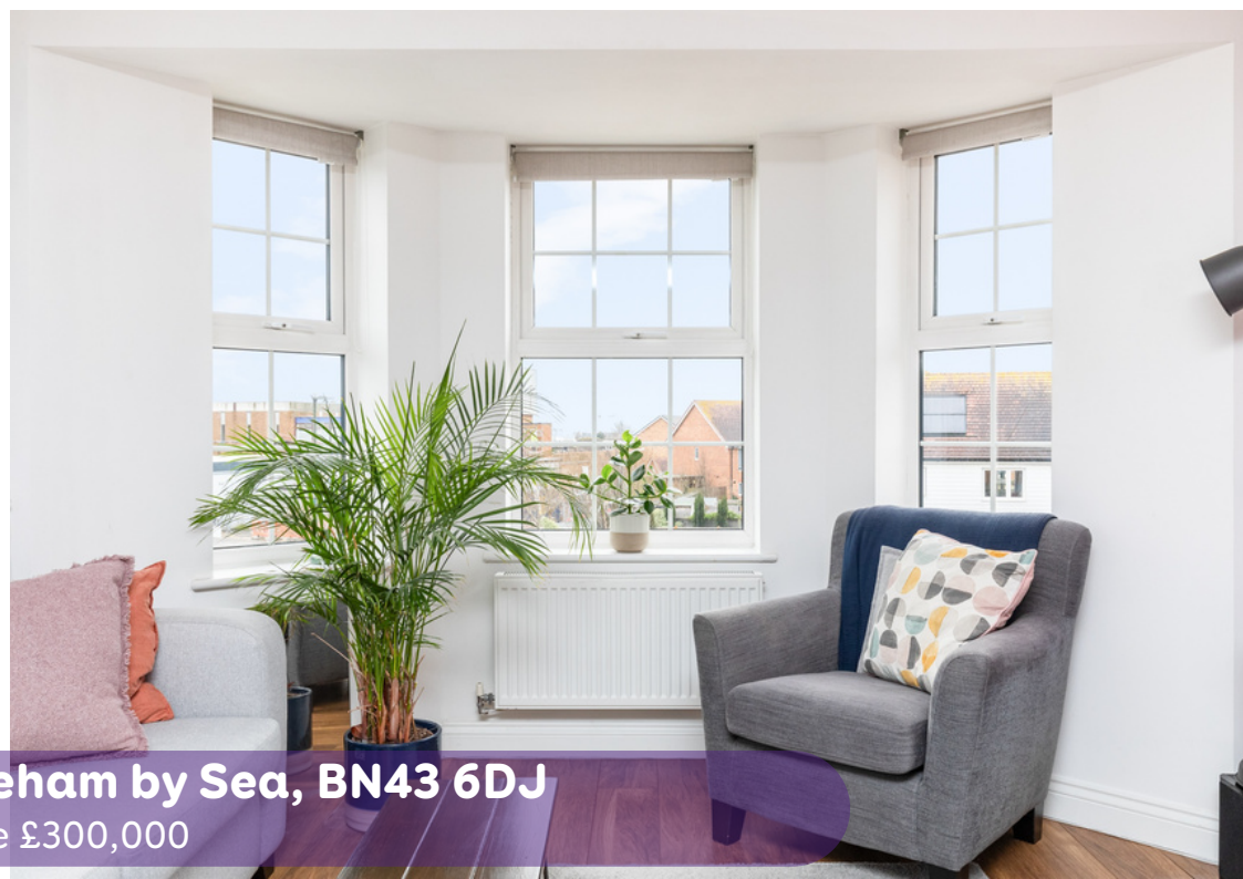
Longstaff House, Shoreham by Sea, BN43 6DJ Guide Price £300,000