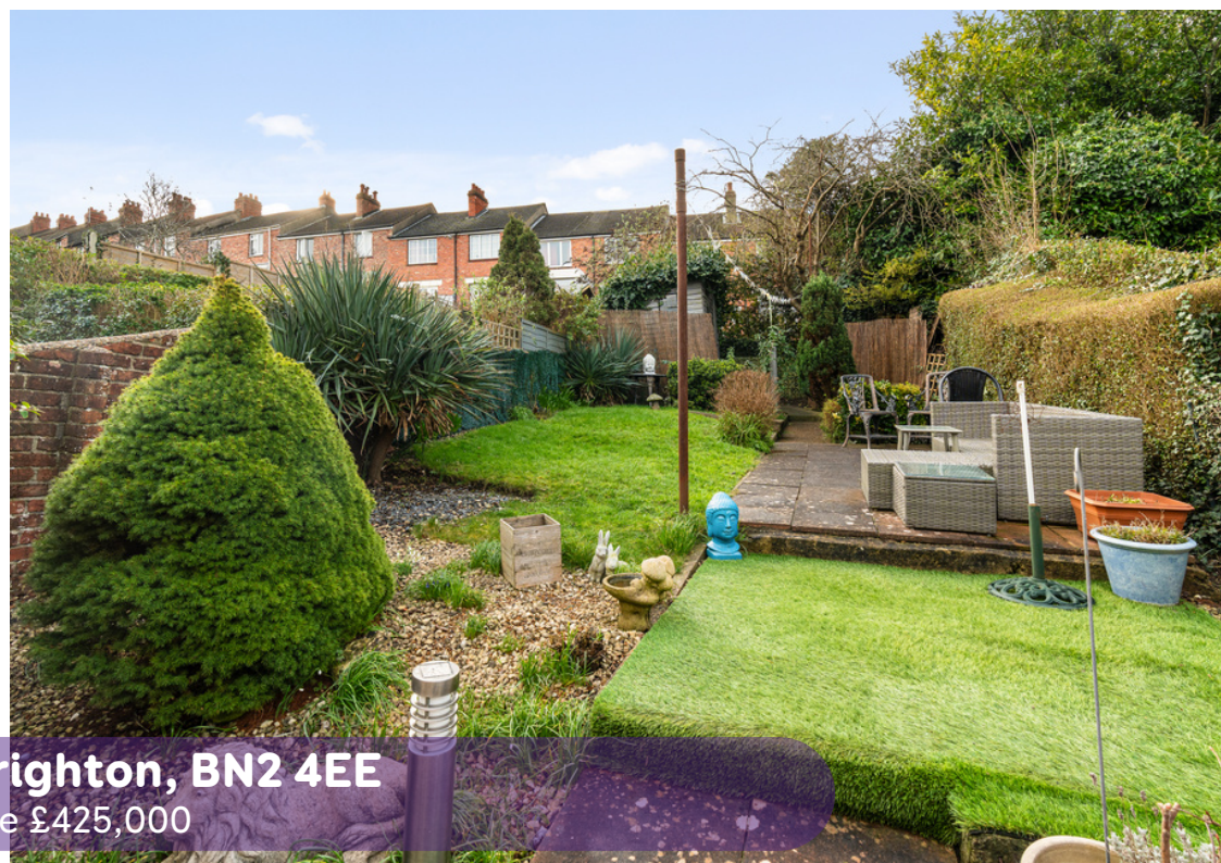
Coombe Road, Brighton, BN2 4EE Asking Price £425,000