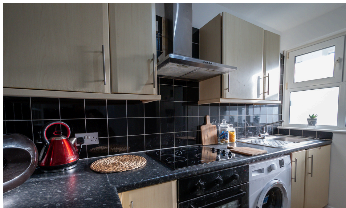
Buckingham Lodge, Buckingham Place, Brighton, BN1 3PL Asking Price £290,000