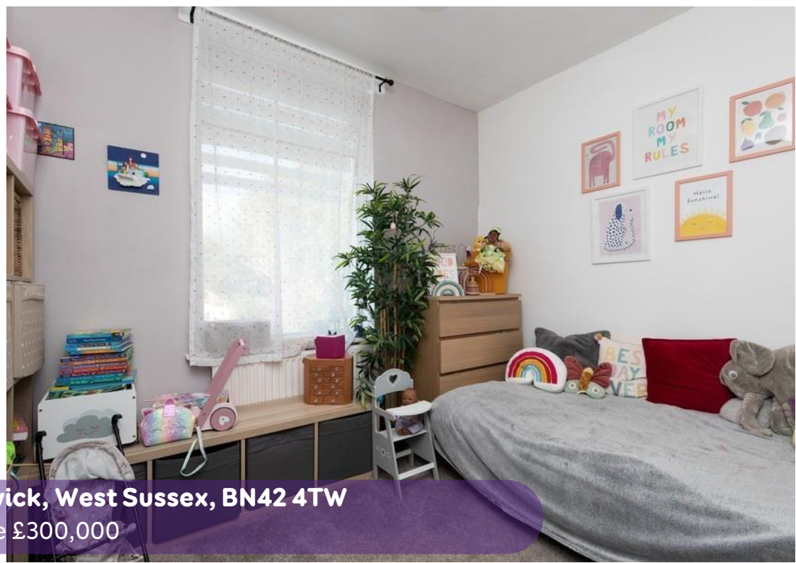
17 Southview Road, Southwick, West Sussex, BN42 4TW Guide Price £300,000