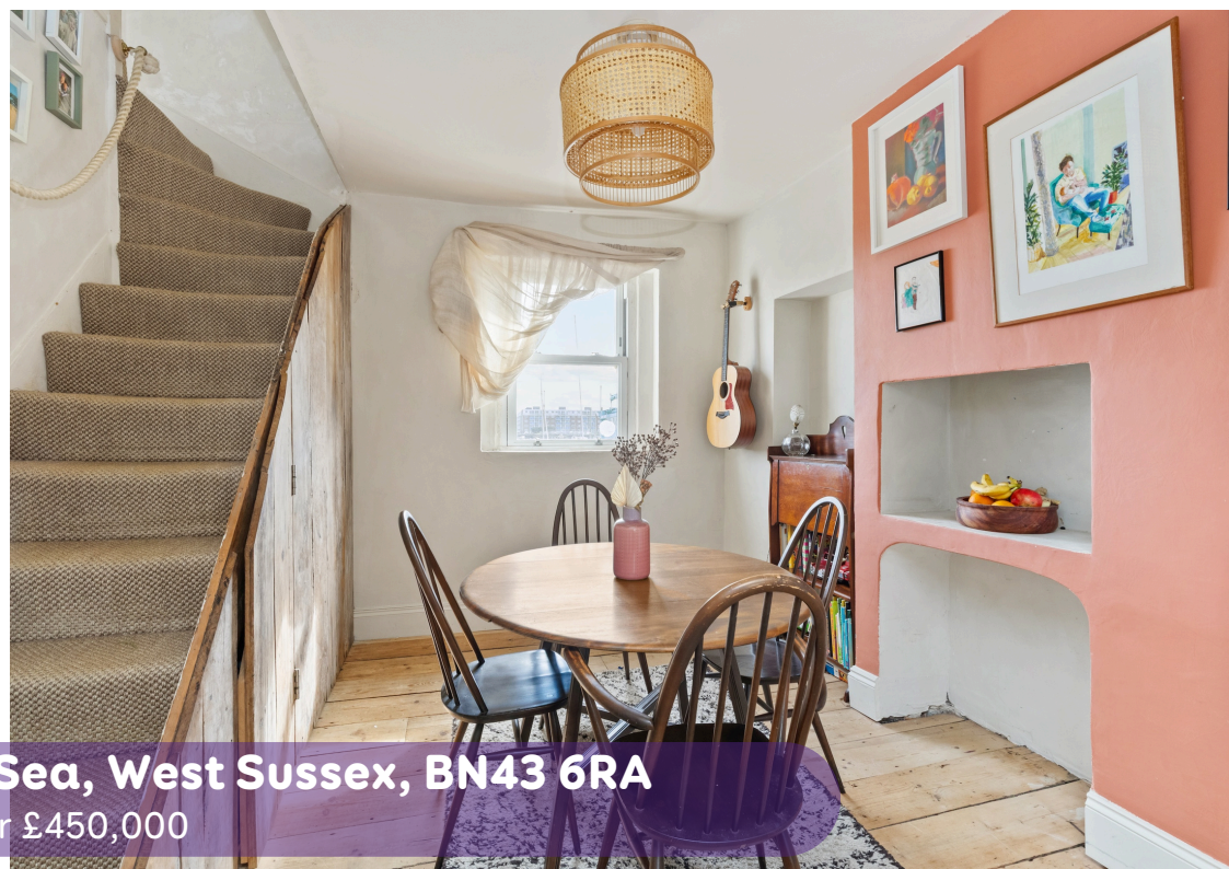
New Road, Shoreham by Sea, West Sussex, BN43 6RA Offers Over £450,000