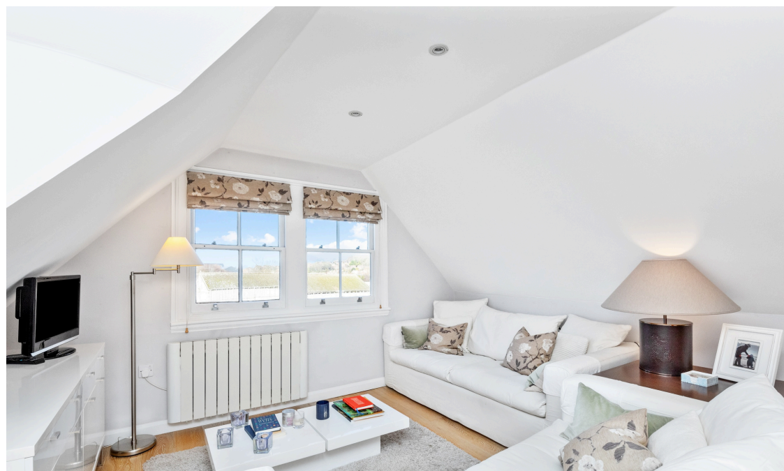
Dial House, Lewes, East Sussex, BN7 2AF Asking Price £395,000