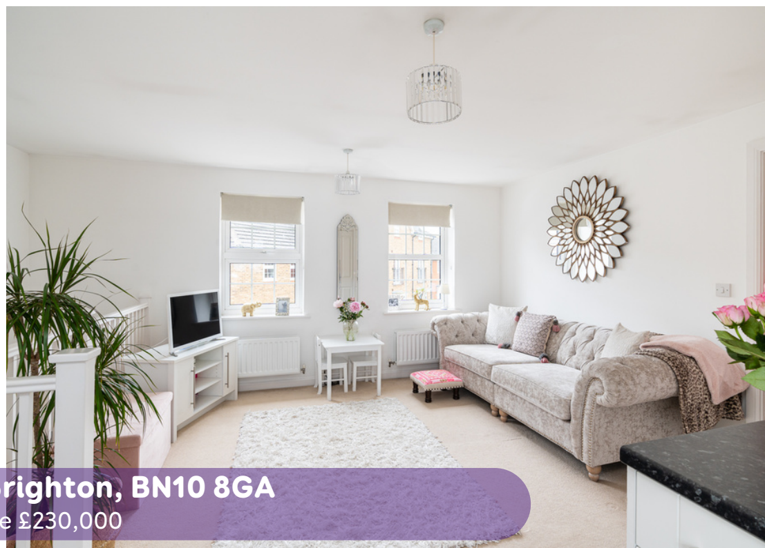
West View Close, Brighton, BN10 8GA Asking Price £230,000