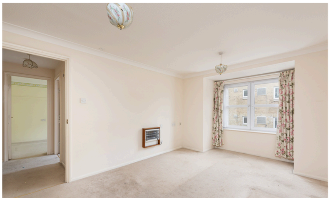
College Court, Brighton, BN2 0BF Asking Price £145,000