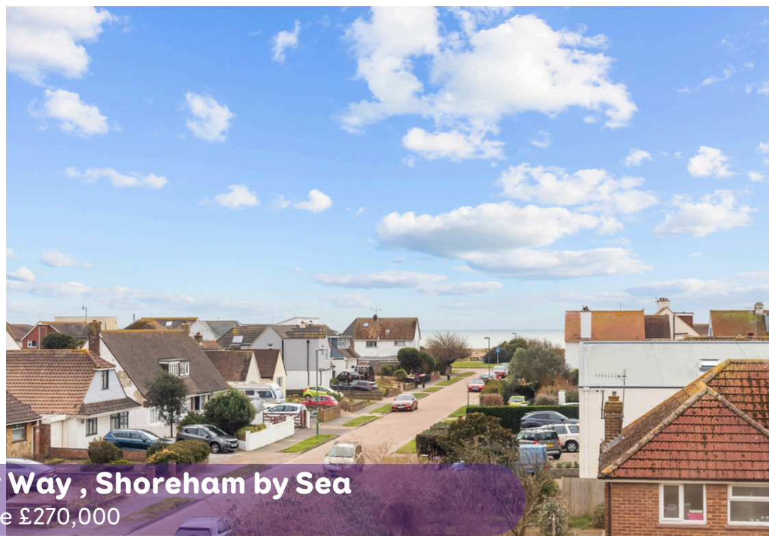
Gosport Court, Harbour Way , Shoreham by Sea Asking Price £270,000