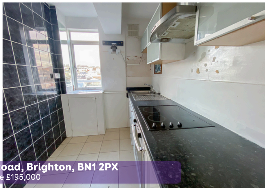
Embassy Court, Kings Road, Brighton, BN1 2PX Asking Price £195,000