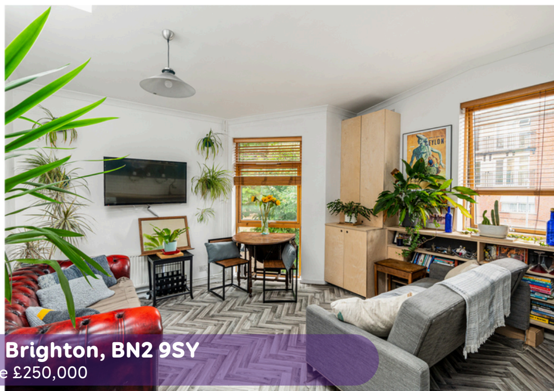
Old College House, Brighton, BN2 9SY Asking Price £250,000