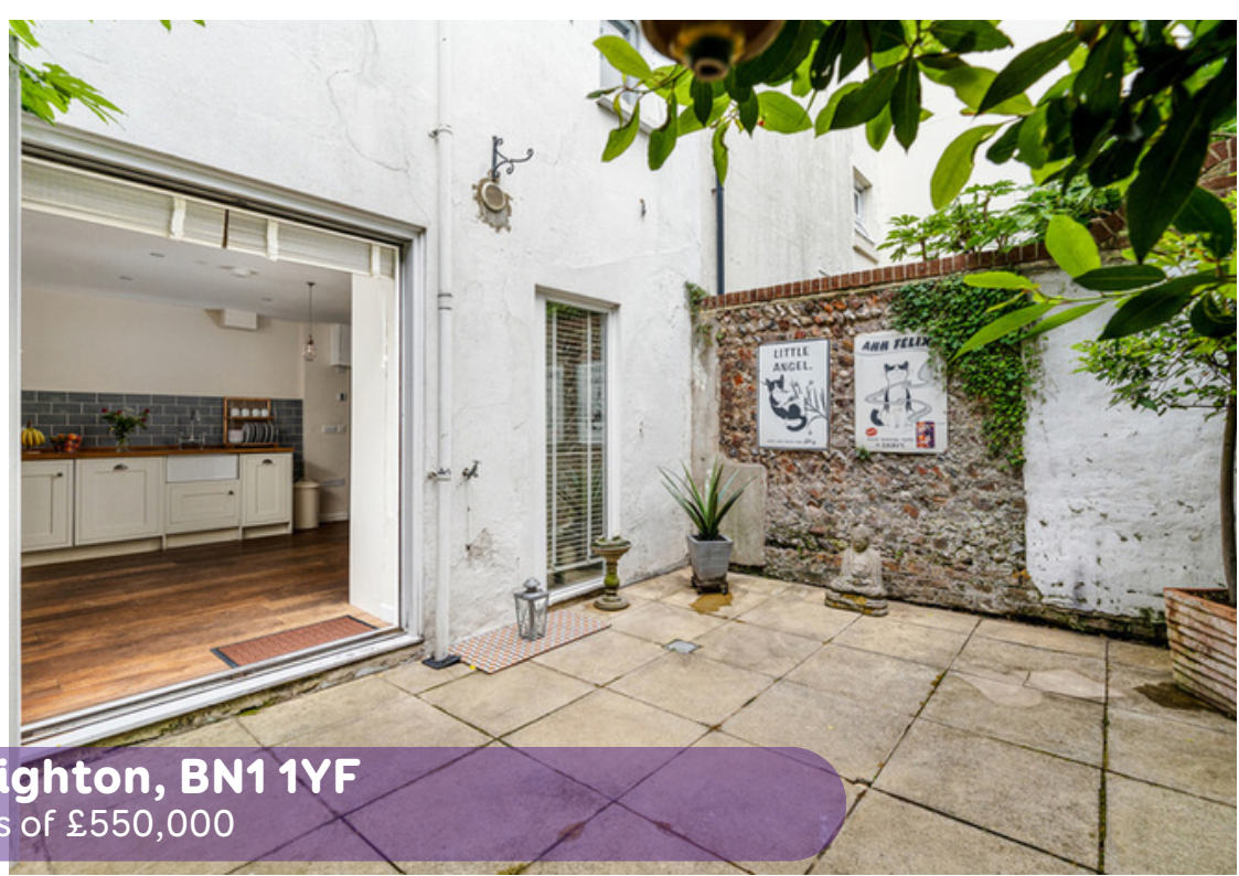
North Place, Brighton, BN1 1YF Offers in Excess of £550,000