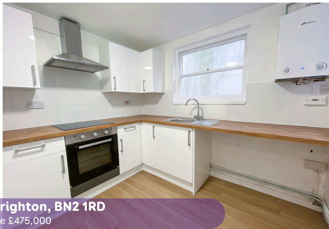
Princes Street, Brighton, BN2 1RD Asking Price £475,000