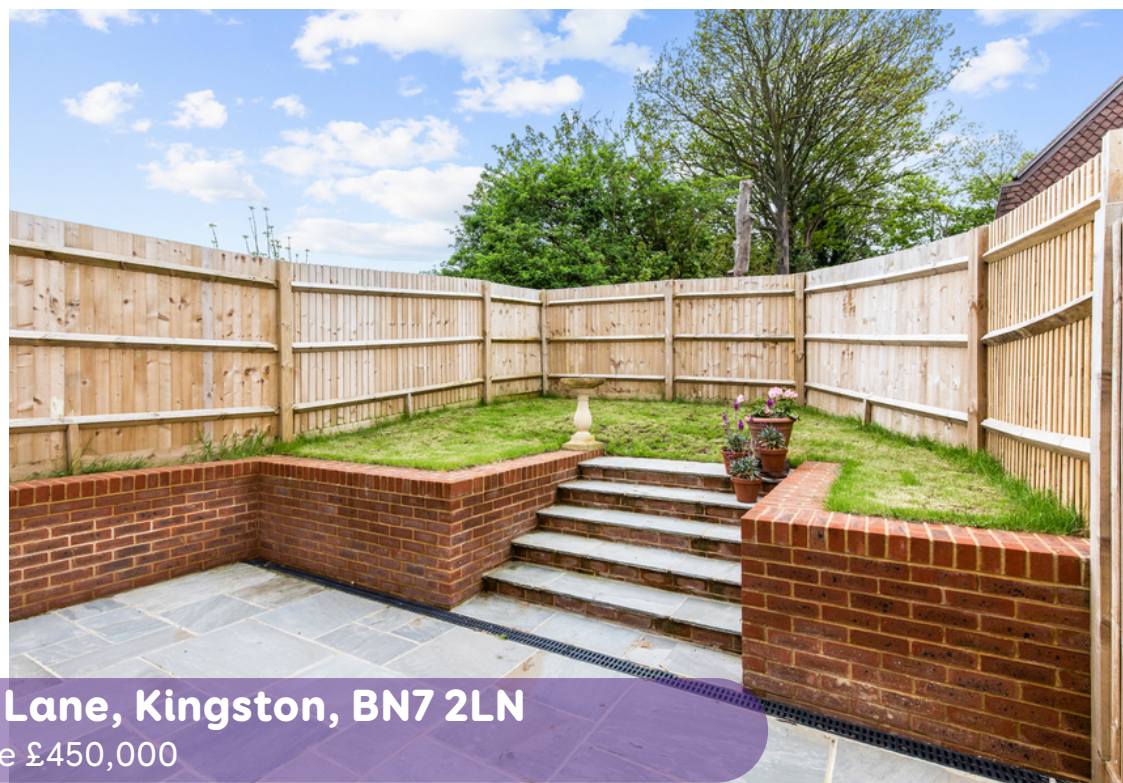
The Old Stables, Church Lane, Kingston, BN7 2LN Asking Price £450,000