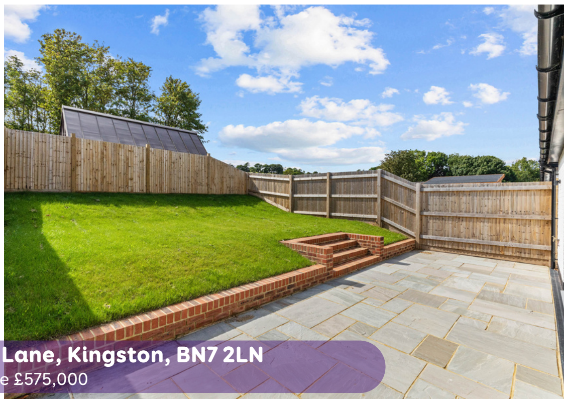
The Old Stables, Church Lane, Kingston, BN7 2LN Asking Price £575,000