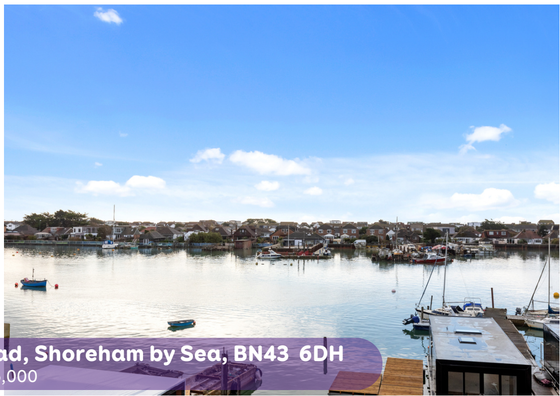
108 Mariner Point, Brighton Road, Shoreham by Sea, BN43 6DH £395,000