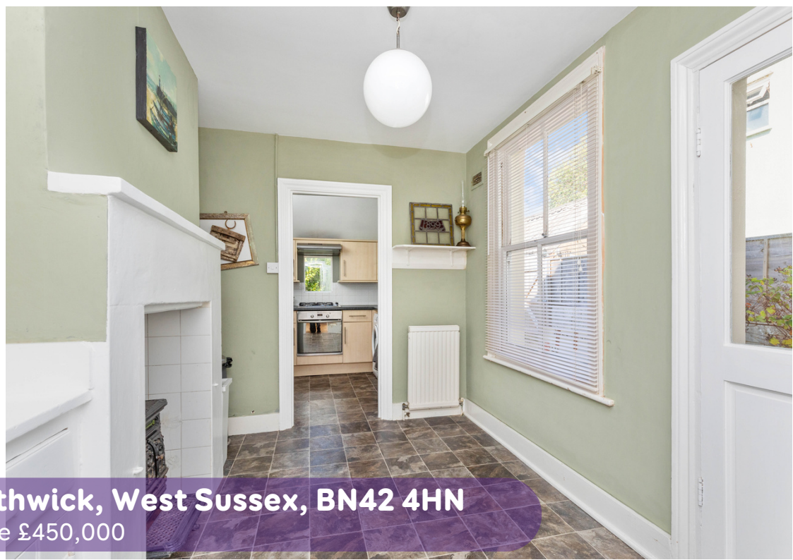
25 Underdown Road, Southwick, West Sussex, BN42 4HN Asking Price £450,000