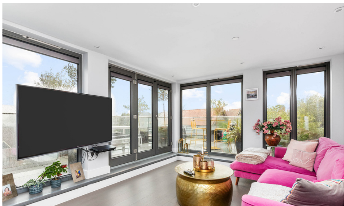
4 The Vaults, Lewes, East Sussex, BN7 2LT Asking Price £980,000