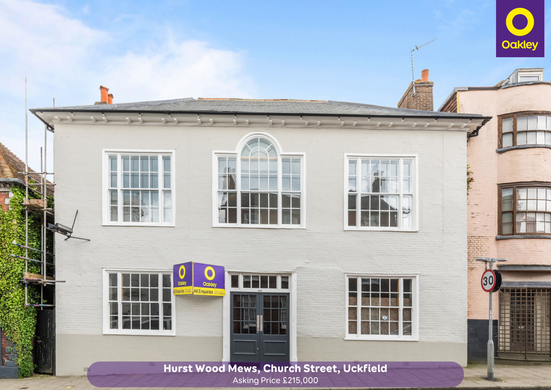
Hurst Wood Mews, Church Street, Uckfield Asking Price £215,000