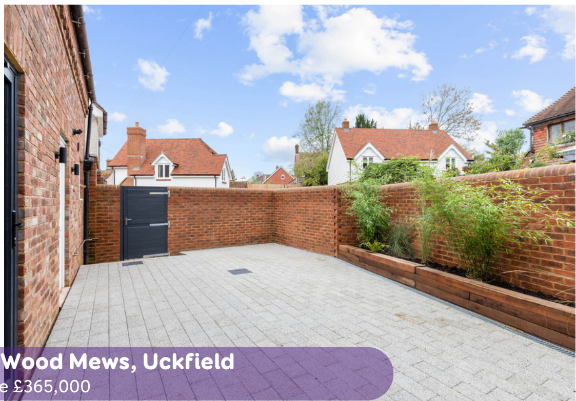
The Cottage, 6 Hurst Wood Mews, Uckfield Asking Price £365,000