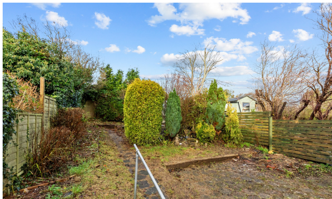
Firle Crescent, Lewes, East Sussex, BN7 1QG Asking Price £475,000