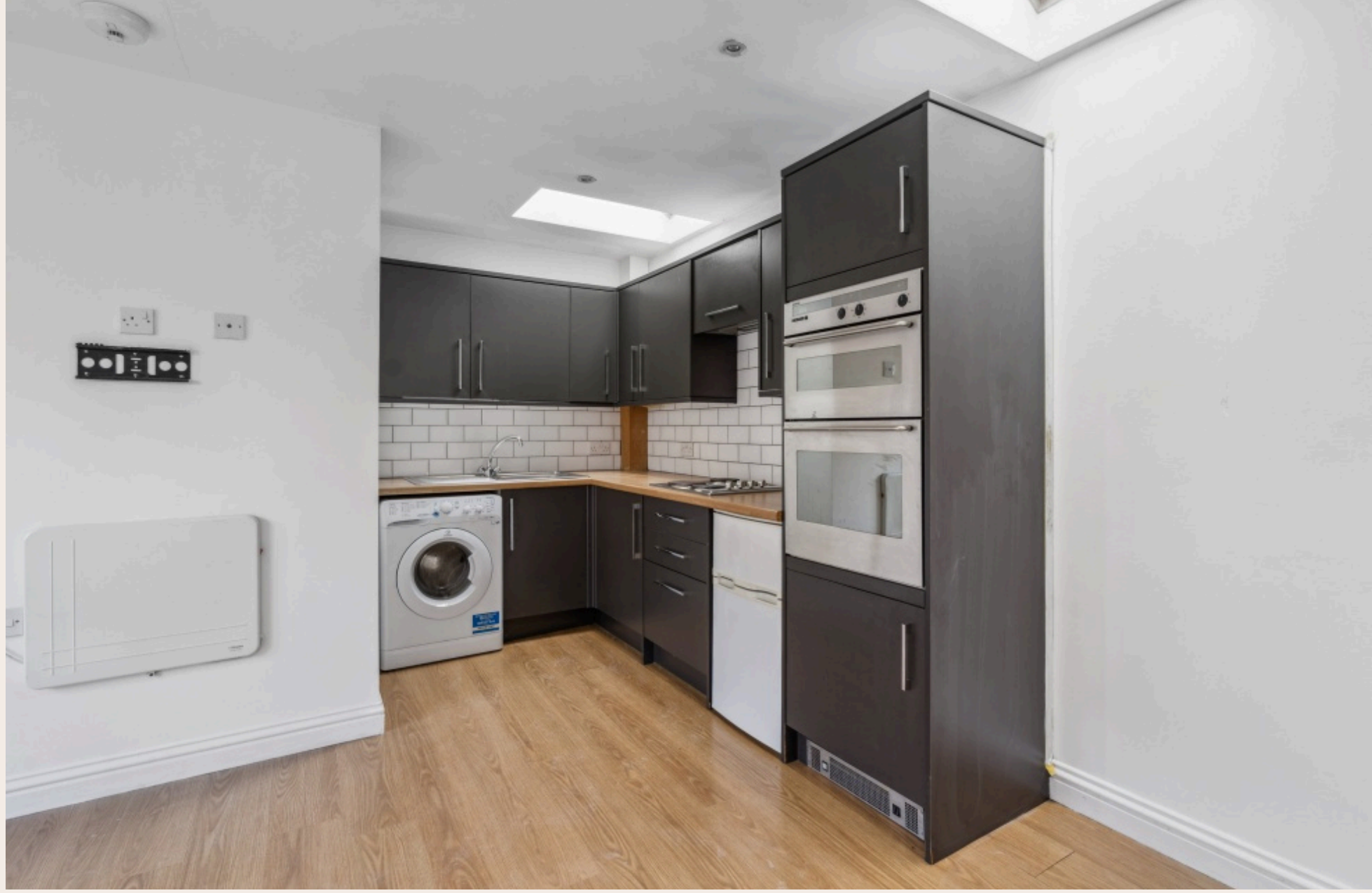
MARWICK COTTAGE, BERKSHIRE