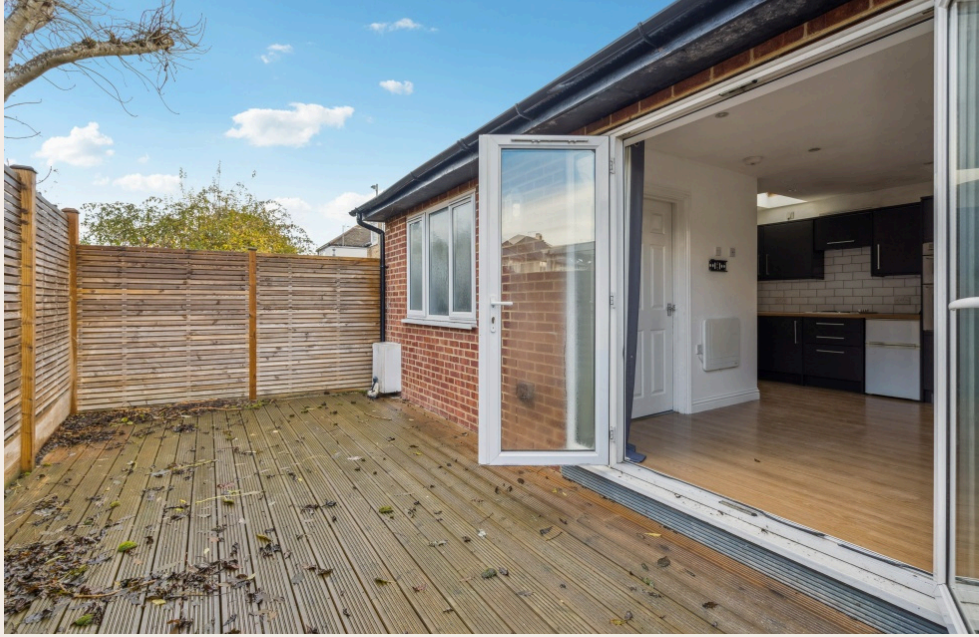
MARWICK COTTAGE, BERKSHIRE