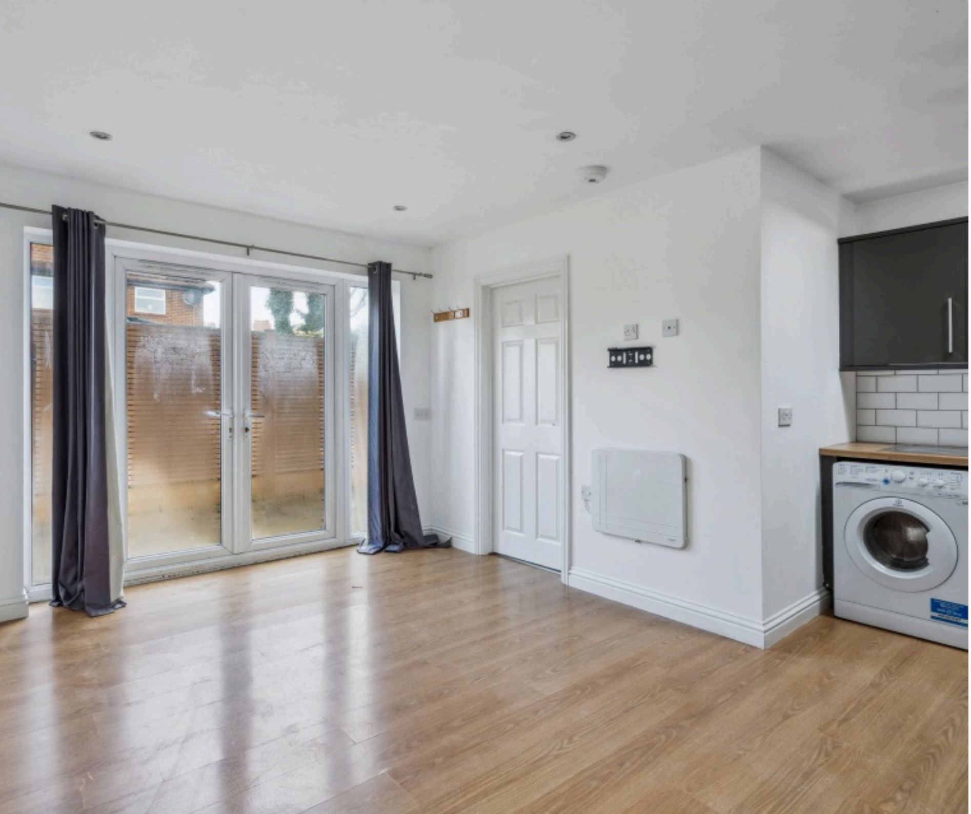
MARWICK COTTAGE, BERKSHIRE