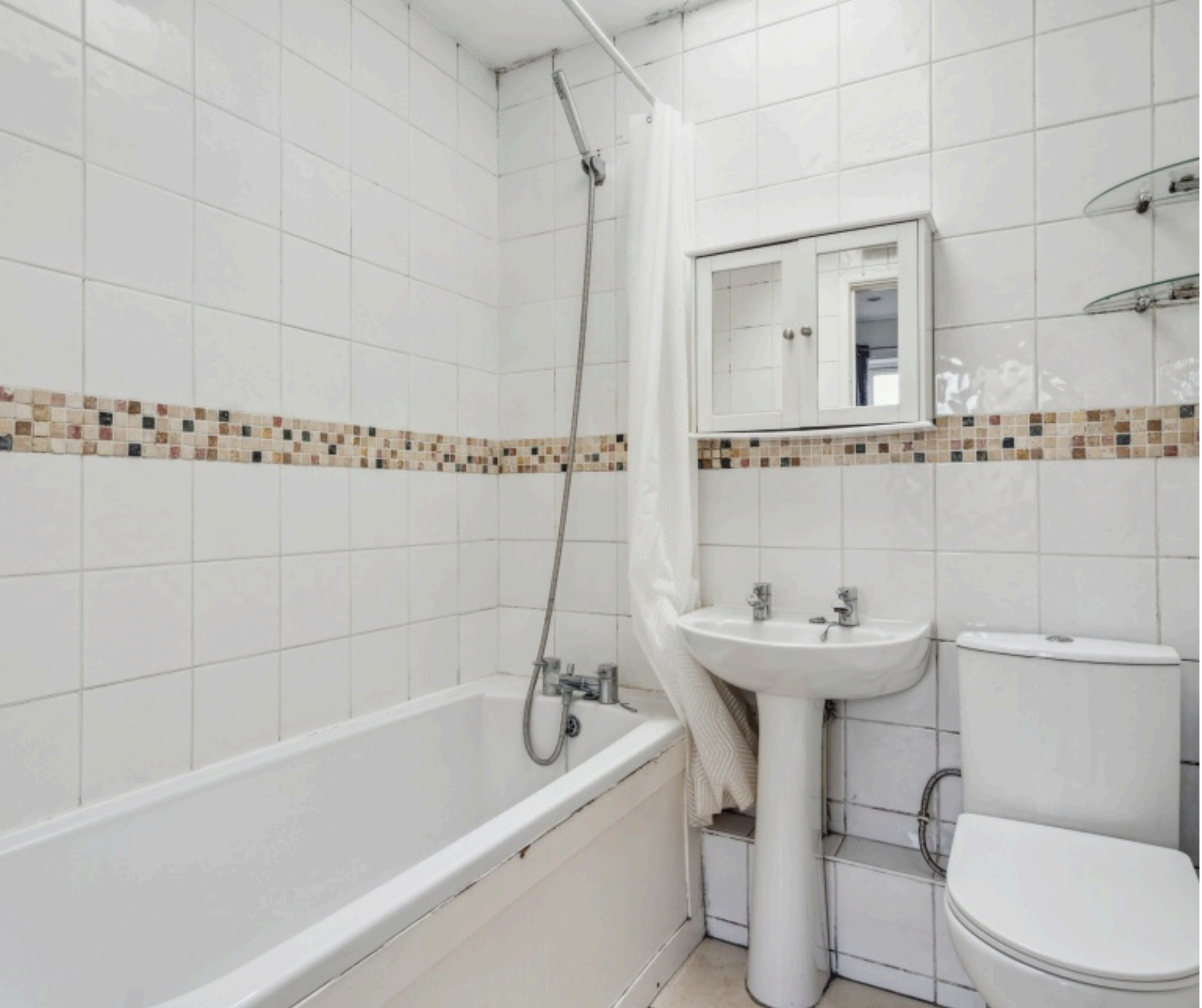
MARWICK COTTAGE, BERKSHIRE