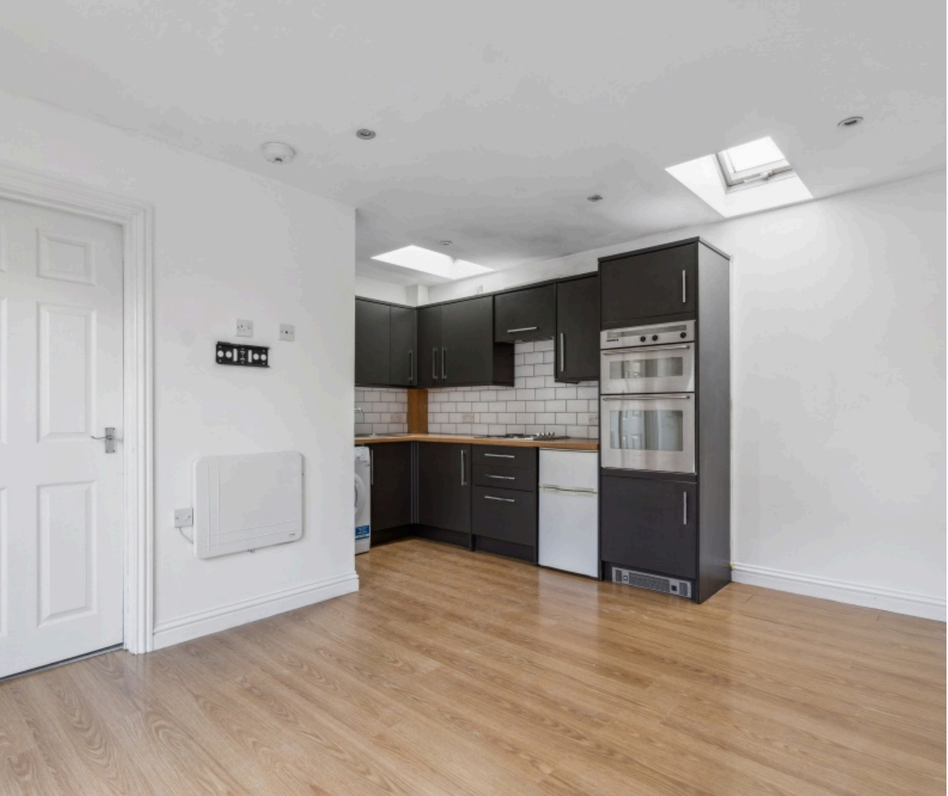
MARWICK COTTAGE, BERKSHIRE