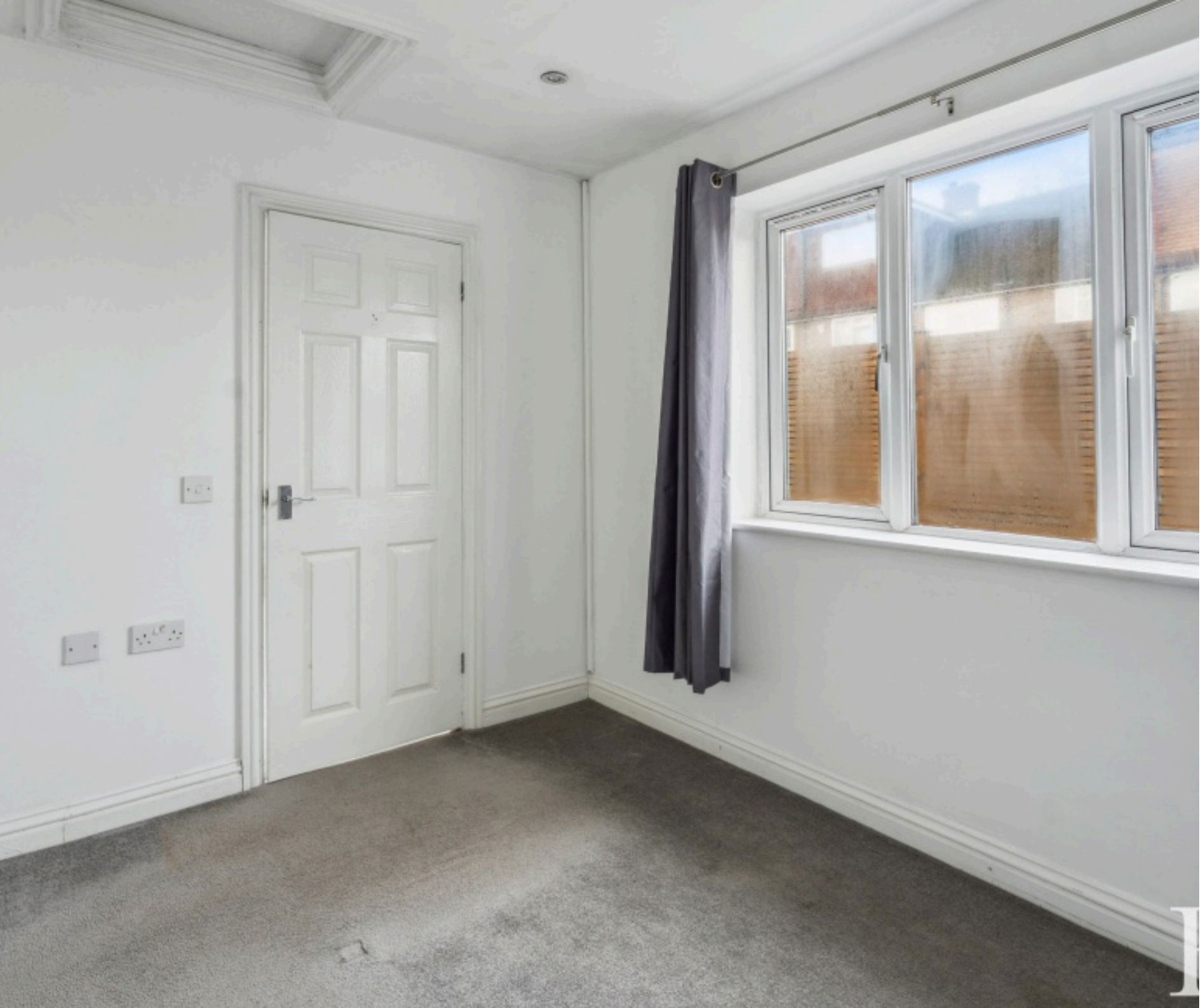
MARWICK COTTAGE, BERKSHIRE