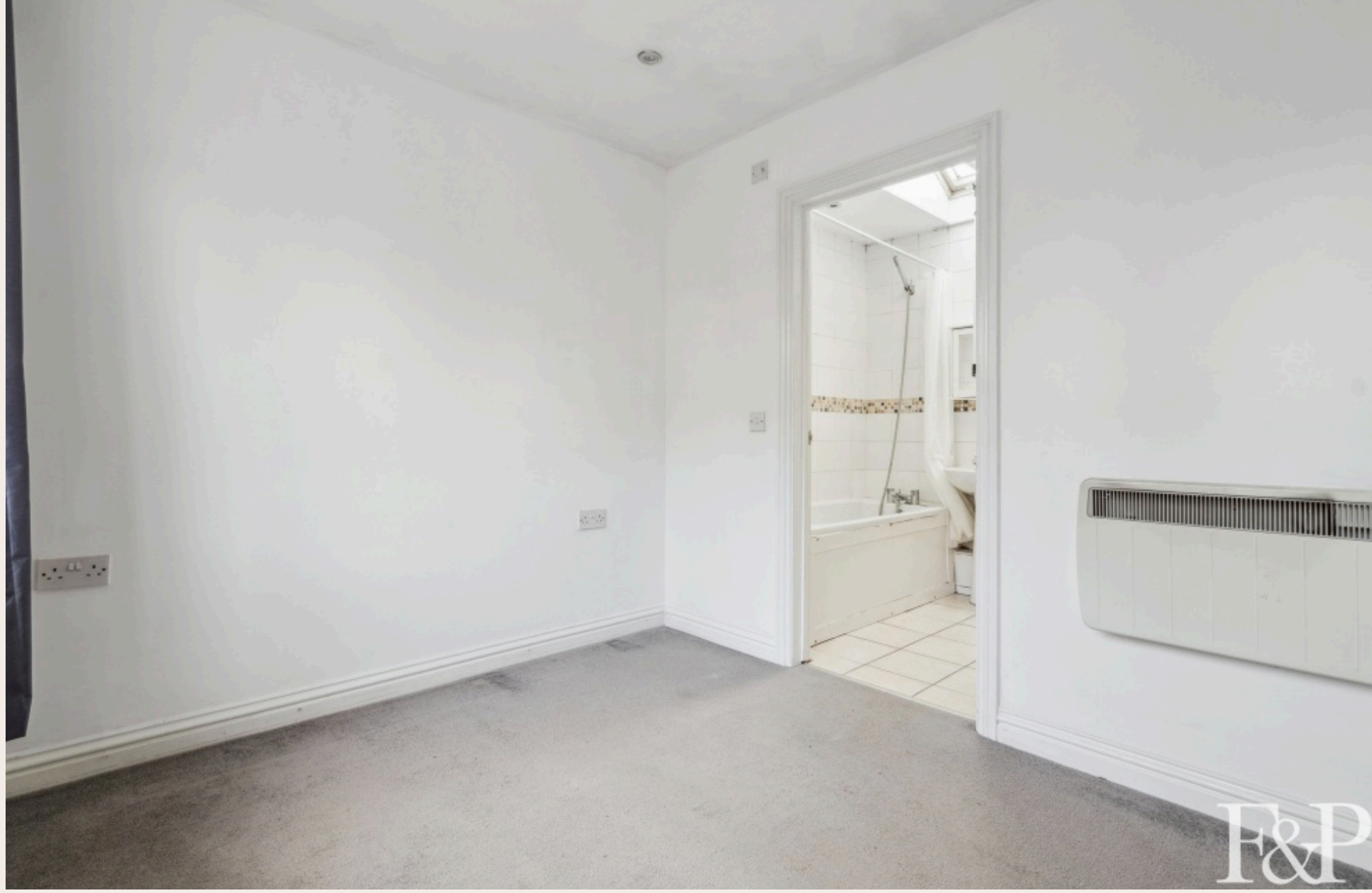
MARWICK COTTAGE, BERKSHIRE