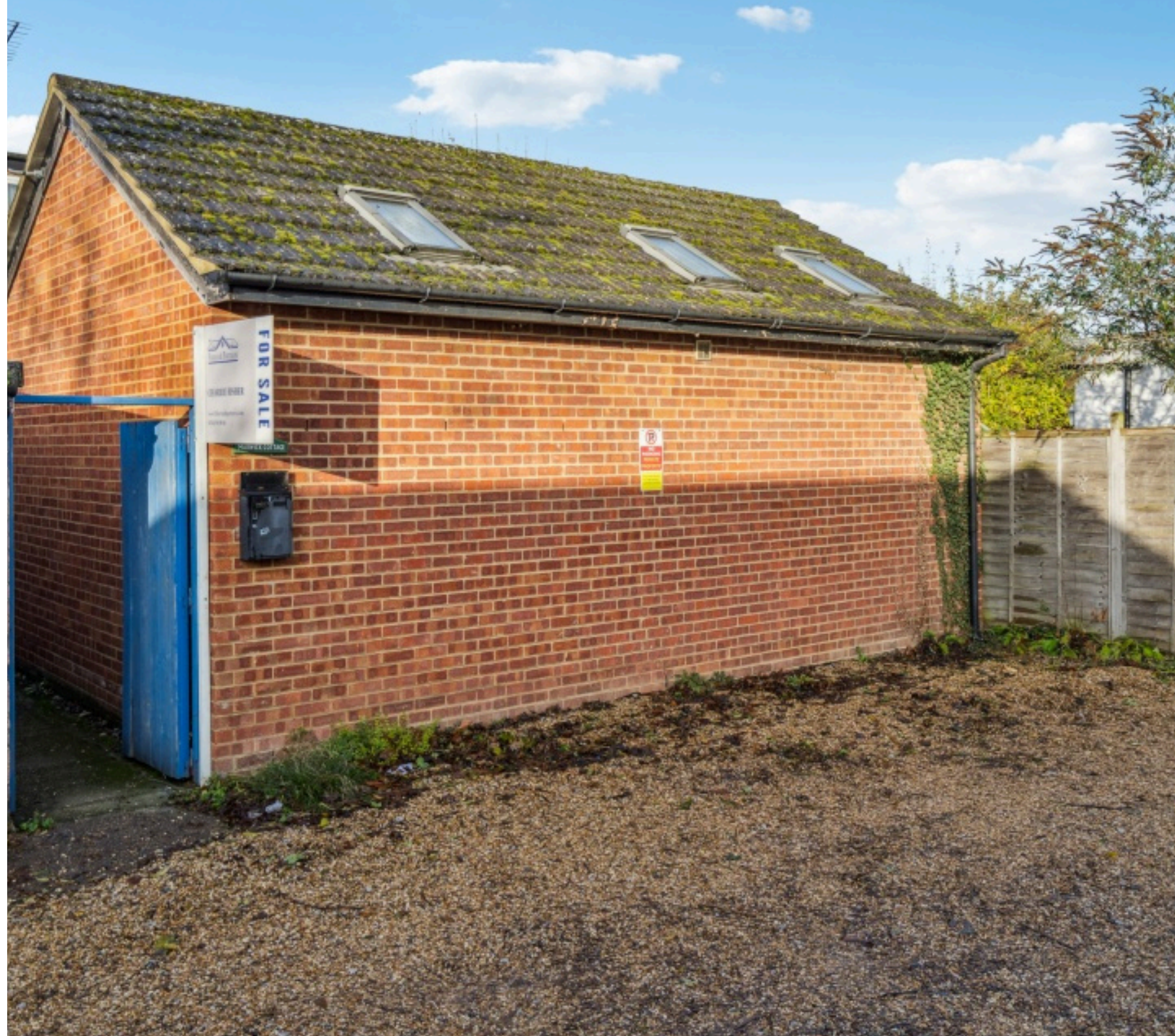
MARWICK COTTAGE, BERKSHIRE