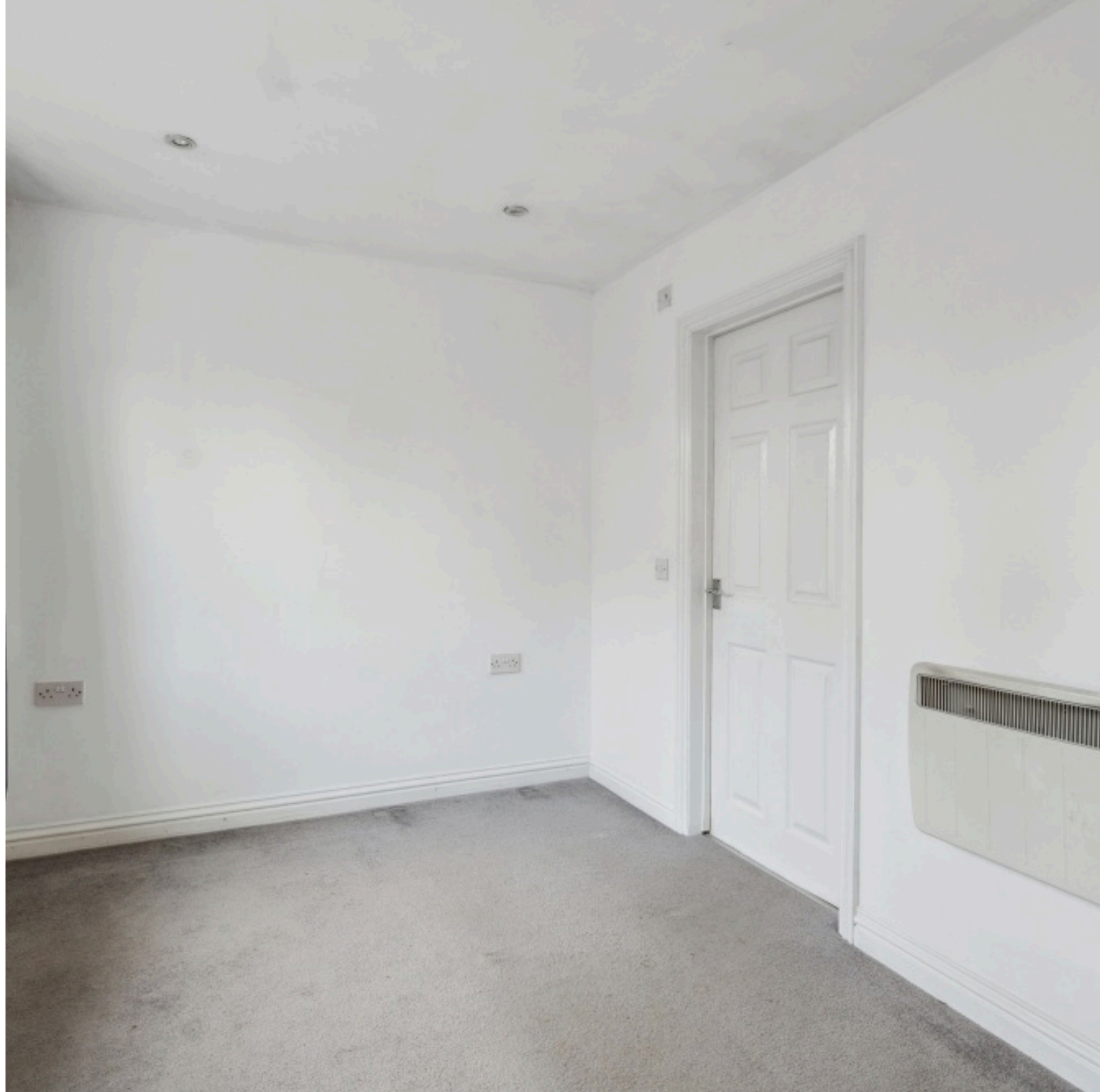
MARWICK COTTAGE, BERKSHIRE