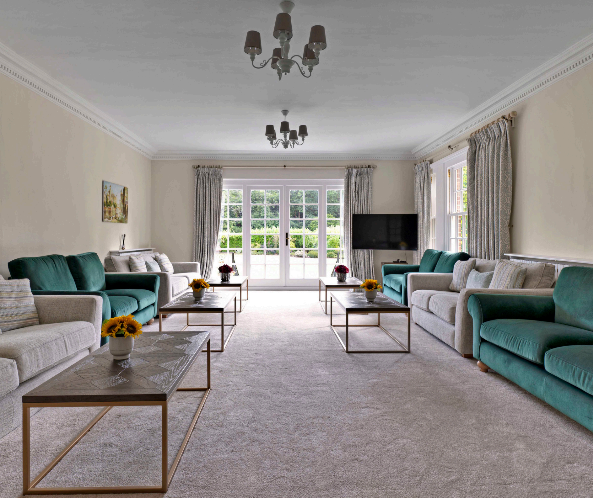
ROUNDWOOD, SUNNINGHILL ROAD, WINDLESHAM