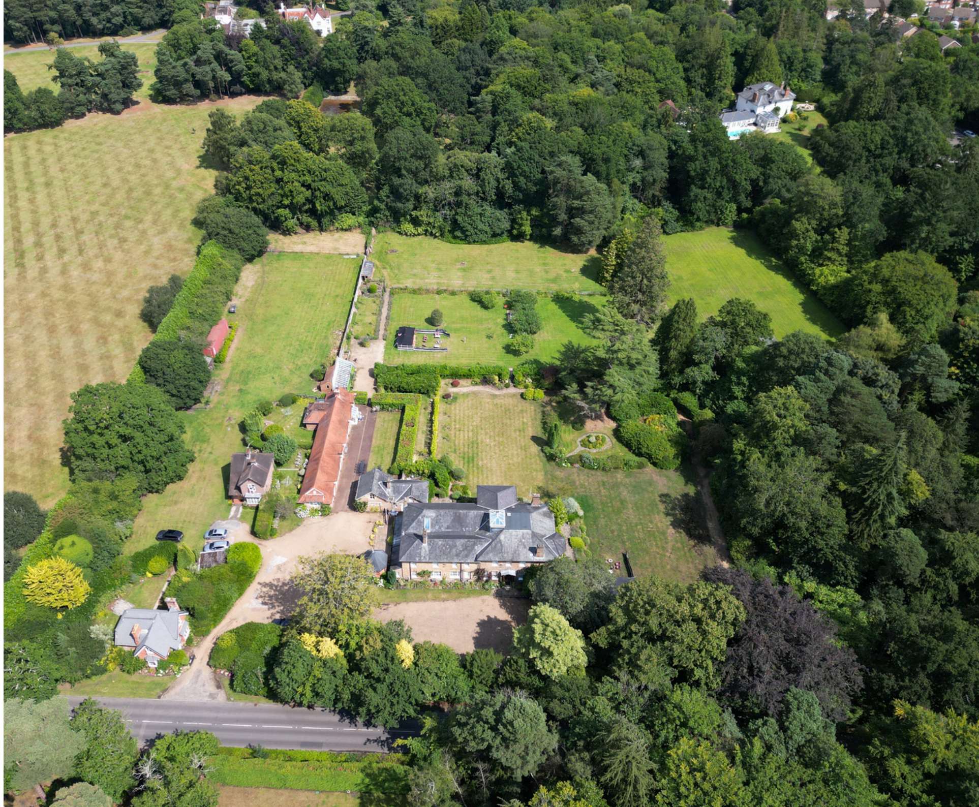
ROUNDWOOD, SUNNINGHILL ROAD, WINDLESHAM