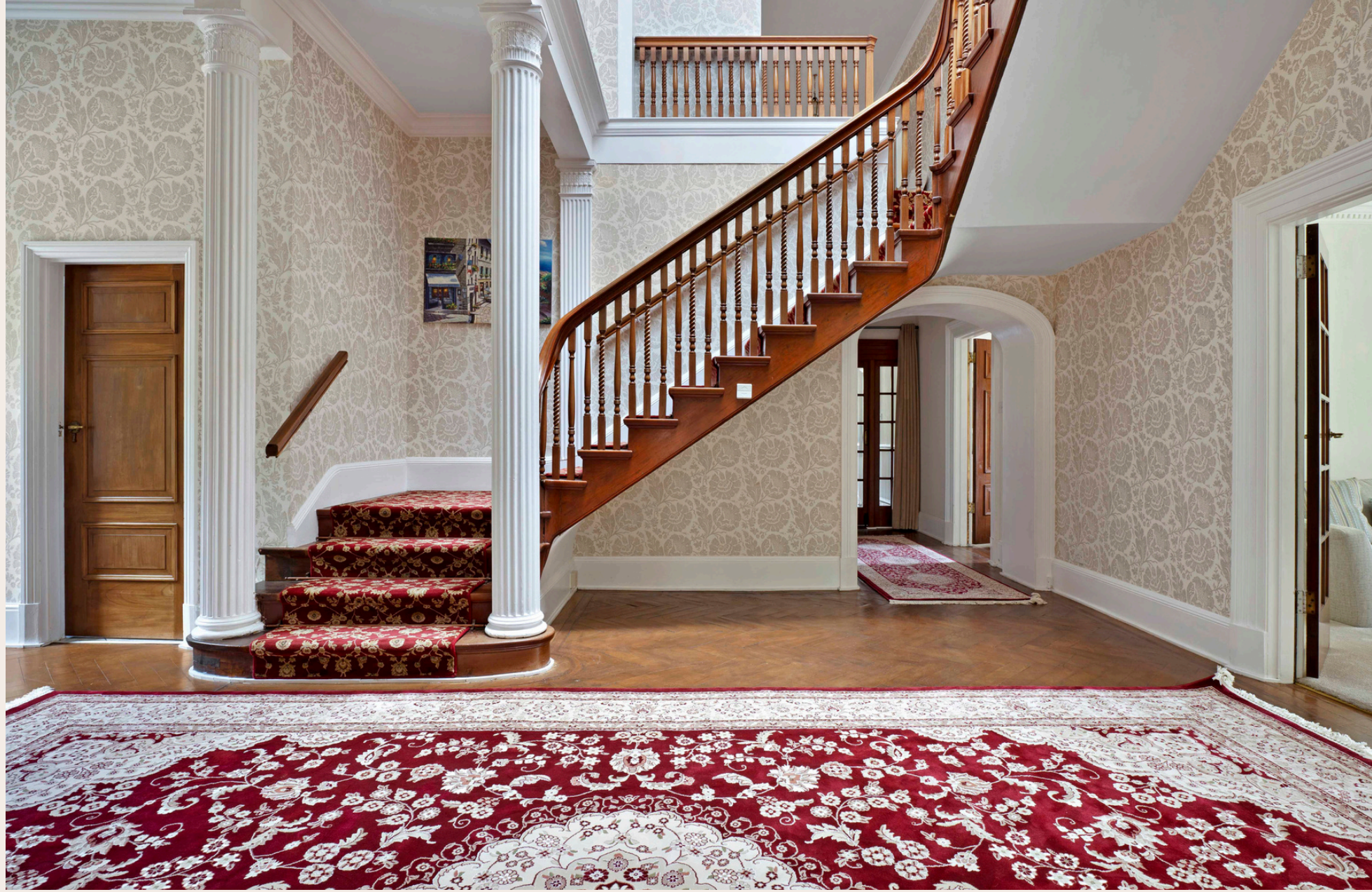
ROUNDWOOD, SUNNINGHILL ROAD, WINDLESHAM