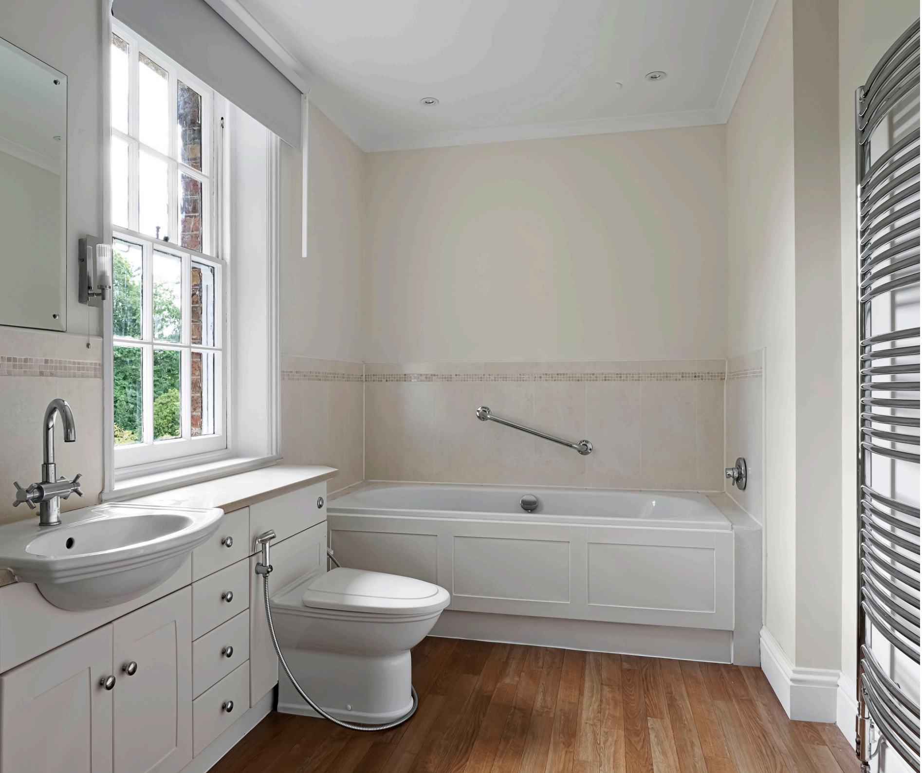
ROUNDWOOD, SUNNINGHILL ROAD, WINDLESHAM