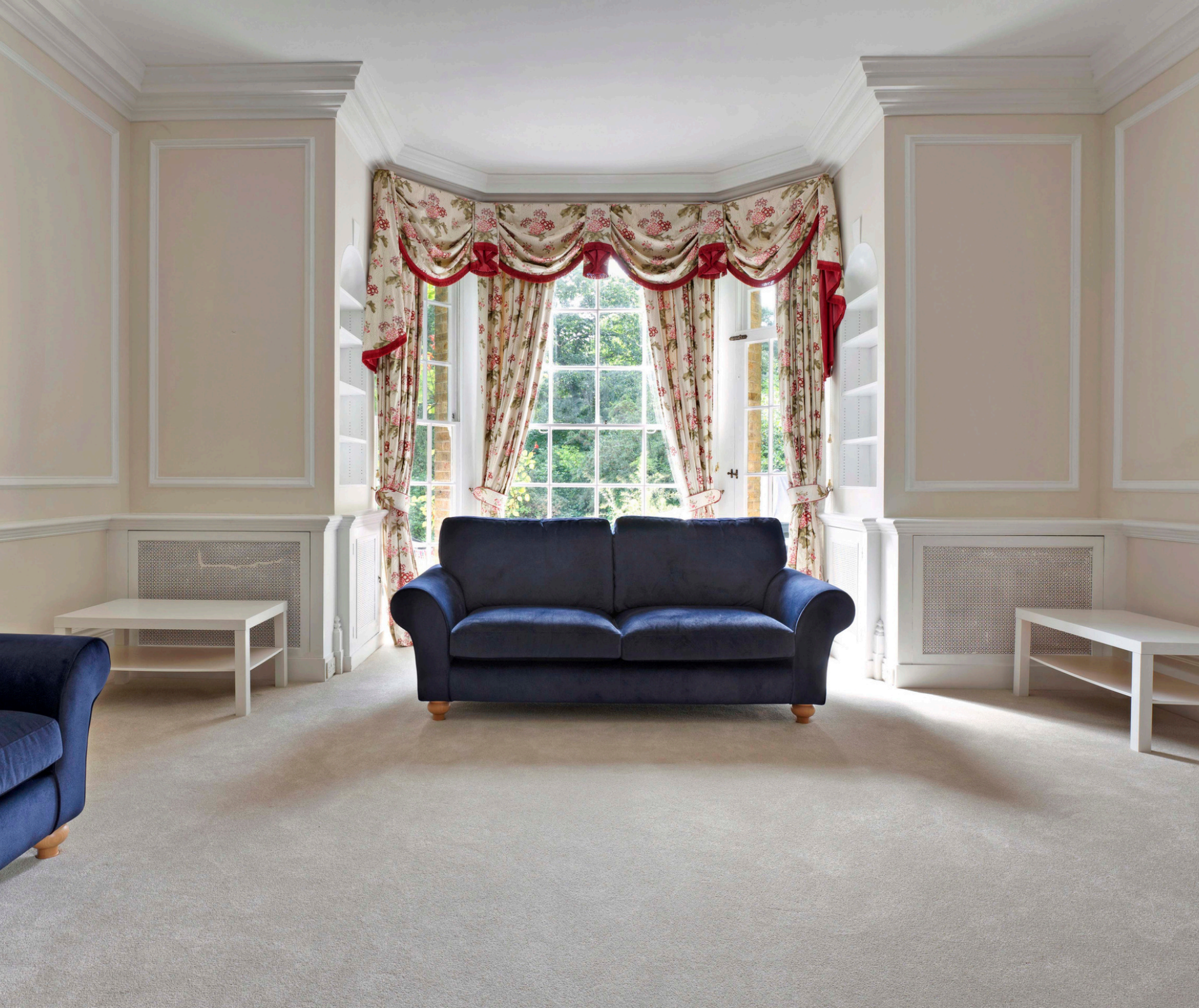
ROUNDWOOD, SUNNINGHILL ROAD, WINDLESHAM