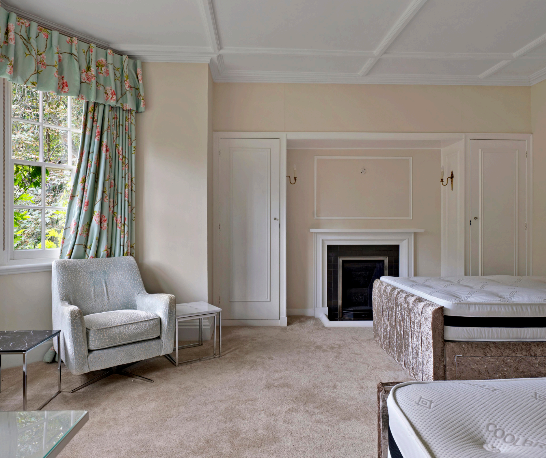
ROUNDWOOD, SUNNINGHILL ROAD, WINDLESHAM