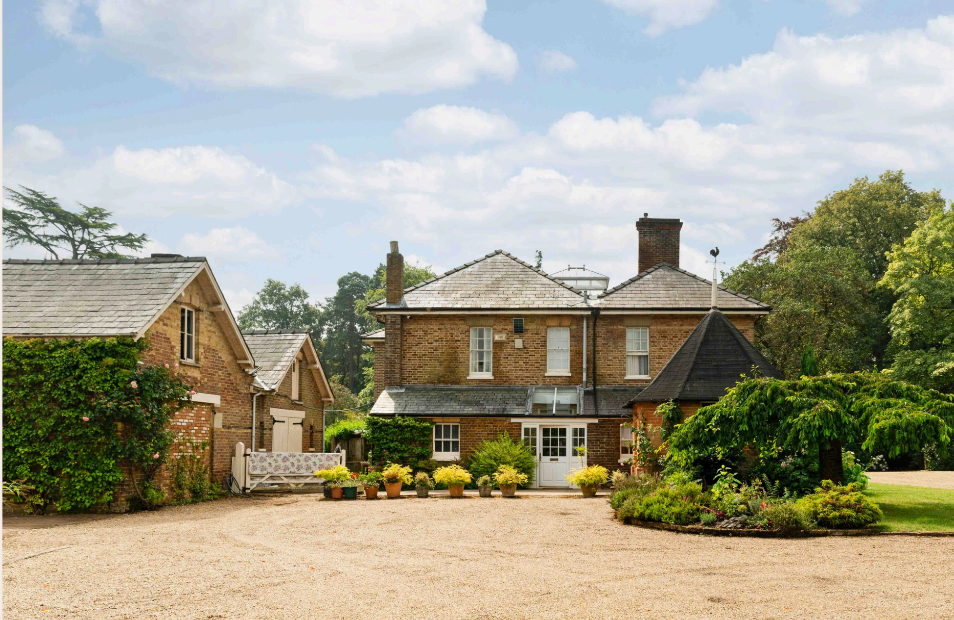
ROUNDWOOD, SUNNINGHILL ROAD, WINDLESHAM