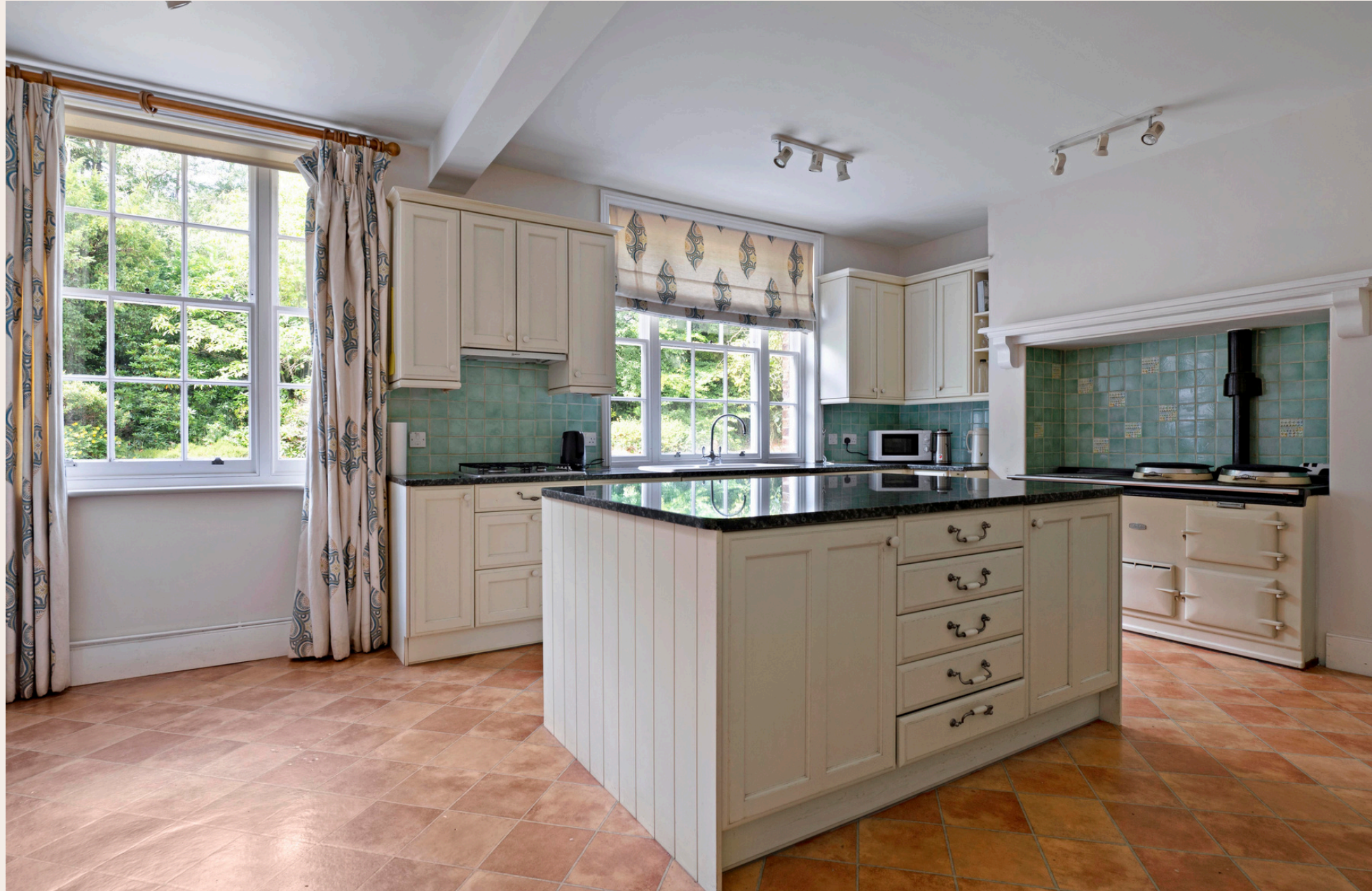
ROUNDWOOD, SUNNINGHILL ROAD, WINDLESHAM