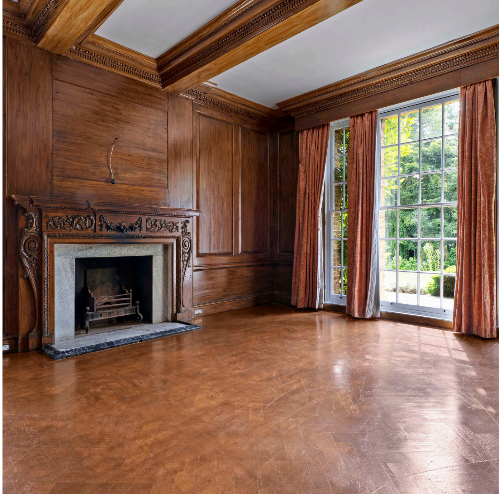
ROUNDWOOD, SUNNINGHILL ROAD, WINDLESHAM