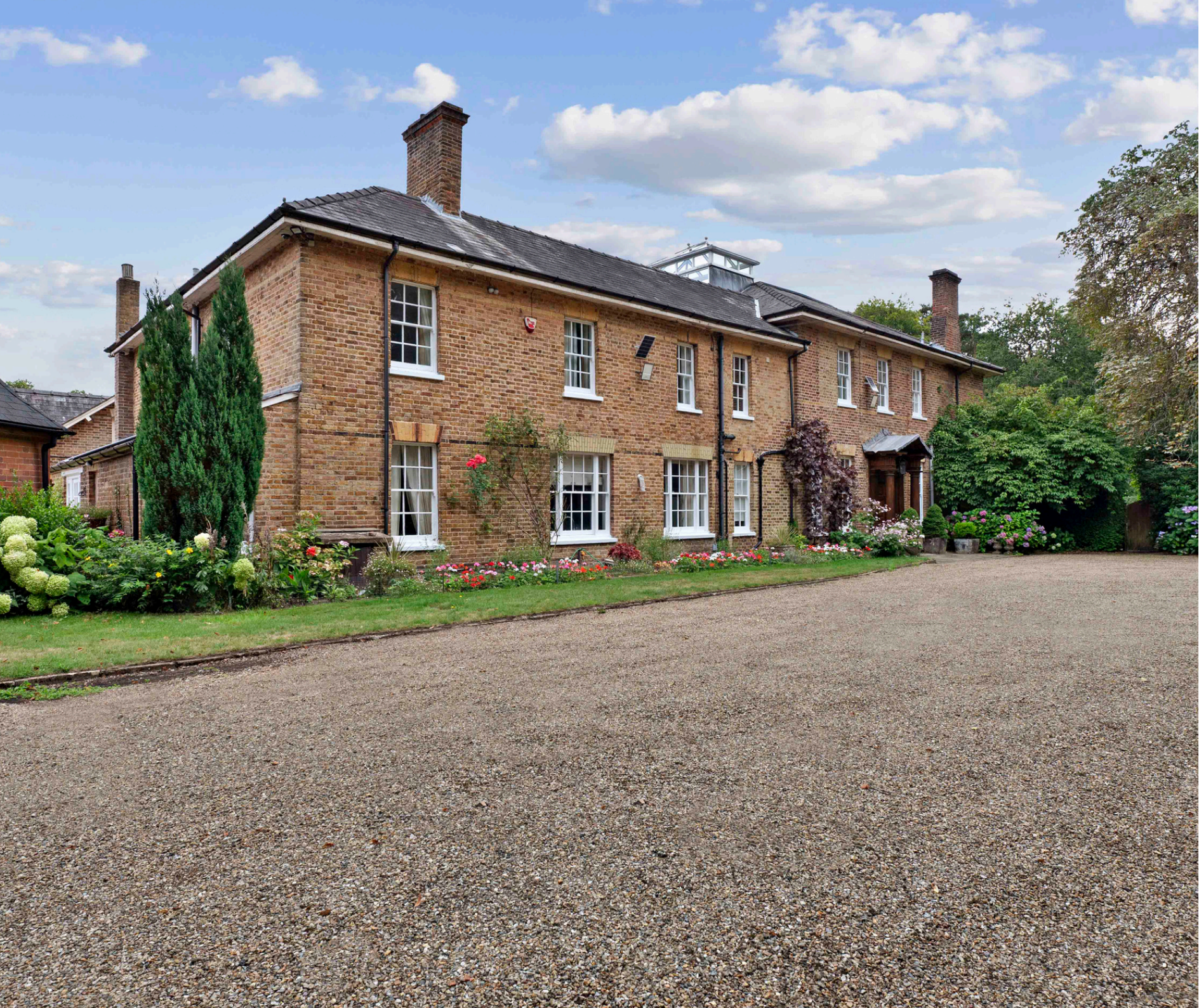
ROUNDWOOD, SUNNINGHILL ROAD, WINDLESHAM