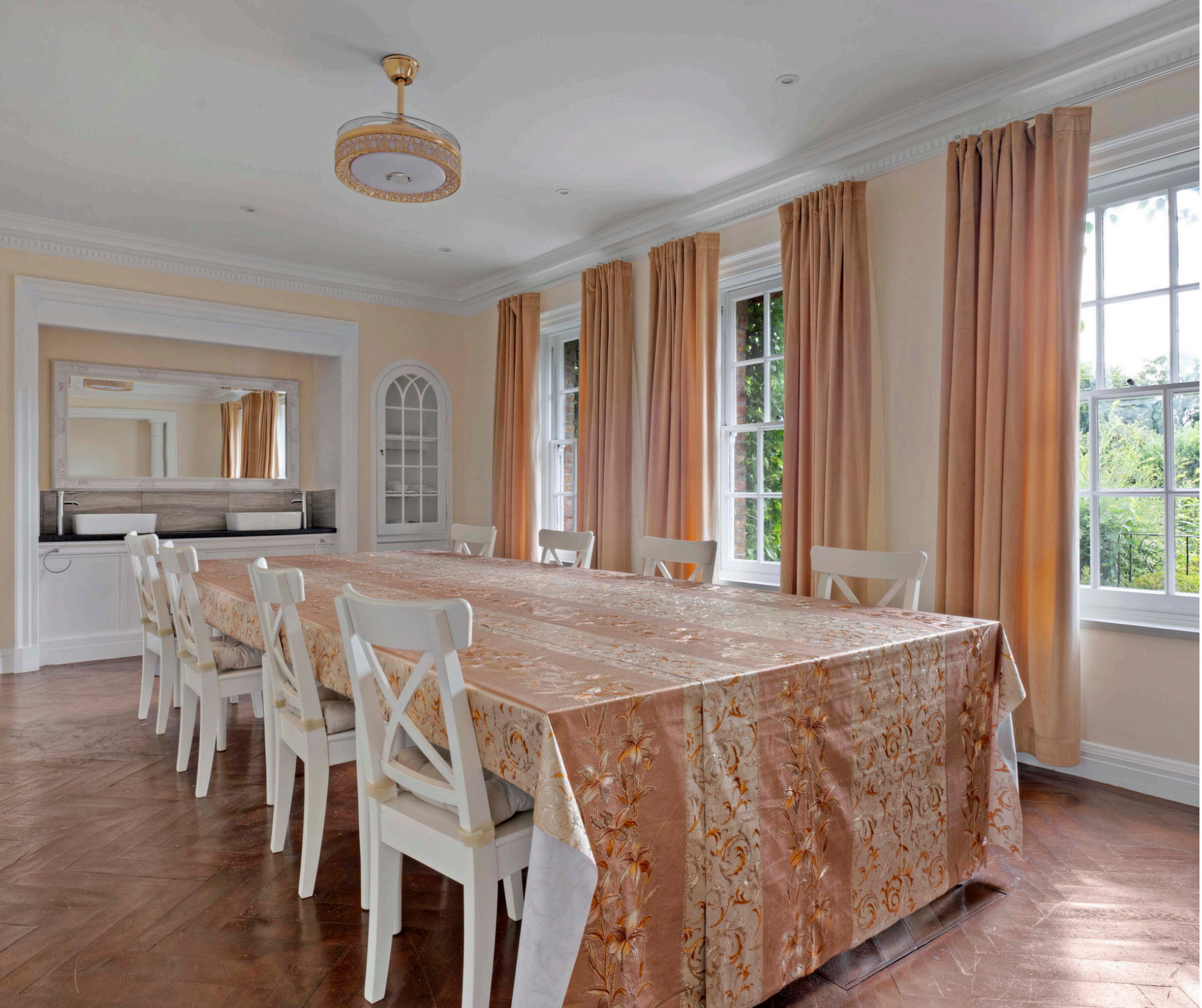
ROUNDWOOD, SUNNINGHILL ROAD, WINDLESHAM