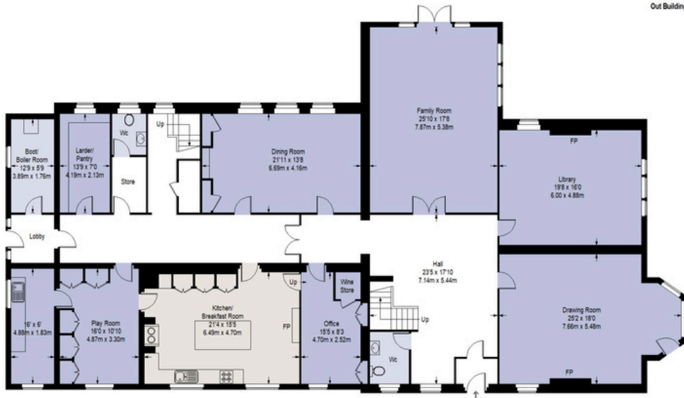
Ground Floor = 521 sq ft