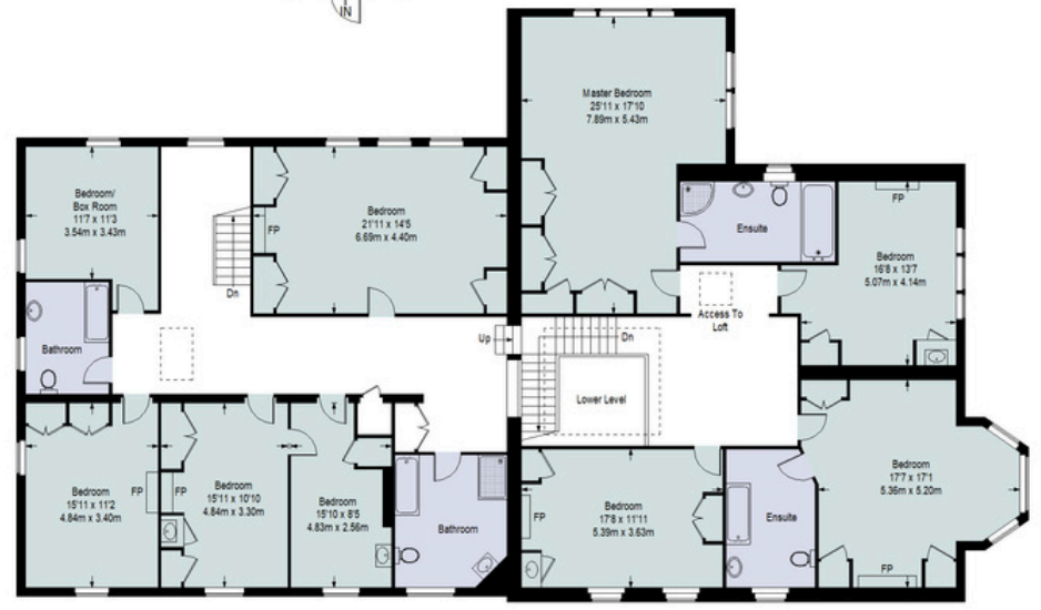
First Floor = 448 sq ft

Approximate Gross Internal Area GROUND FLOOR = 3500 sq ft / 325.15 sq m FIRST FLOOR = 3276 sq ft / 304.34 sq m OUT BUILDING = 1843 sq ft / 171.21 sq m Total = 8619 sq ft / 800.71 sq m