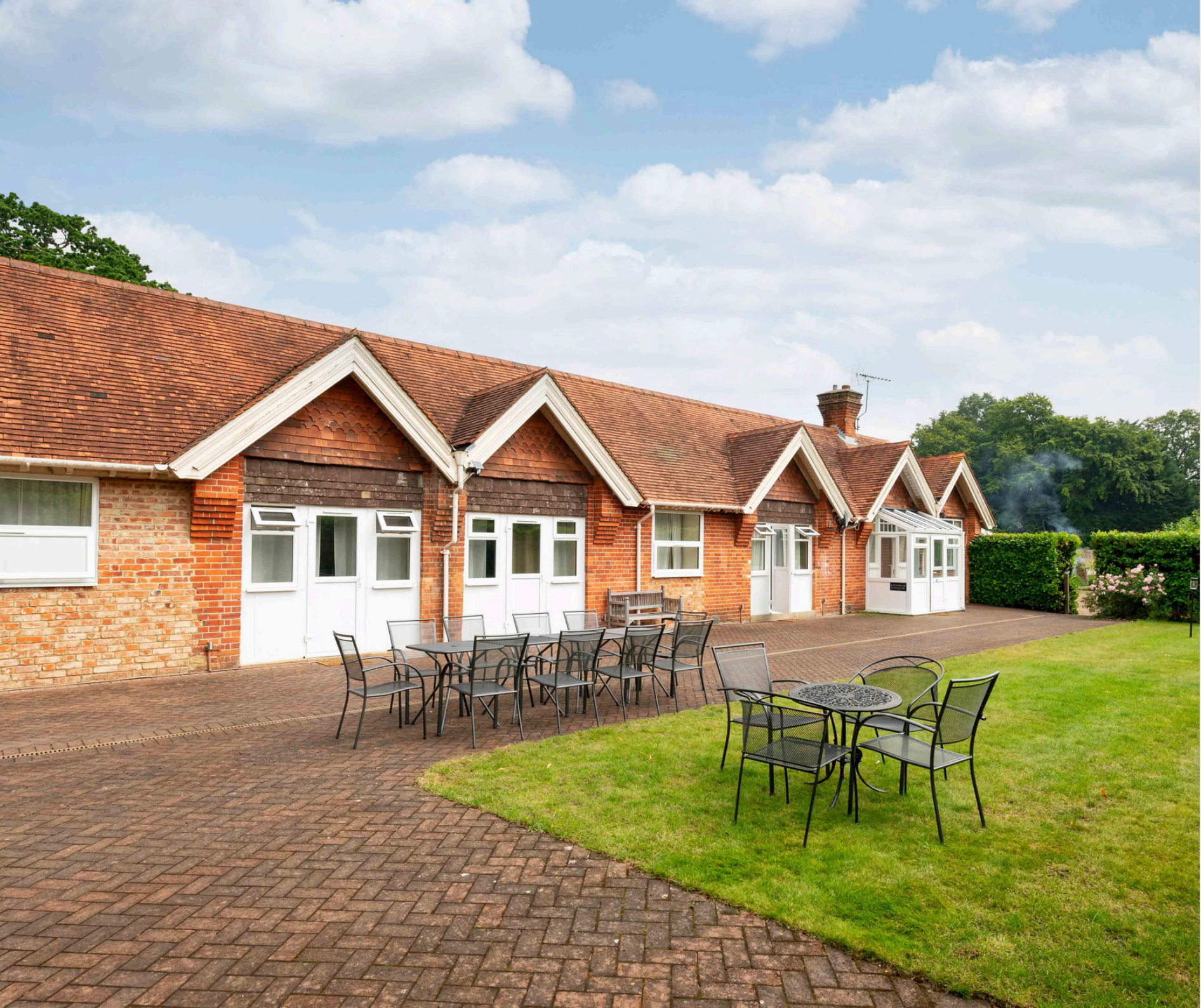
ROUNDWOOD, SUNNINGHILL ROAD, WINDLESHAM