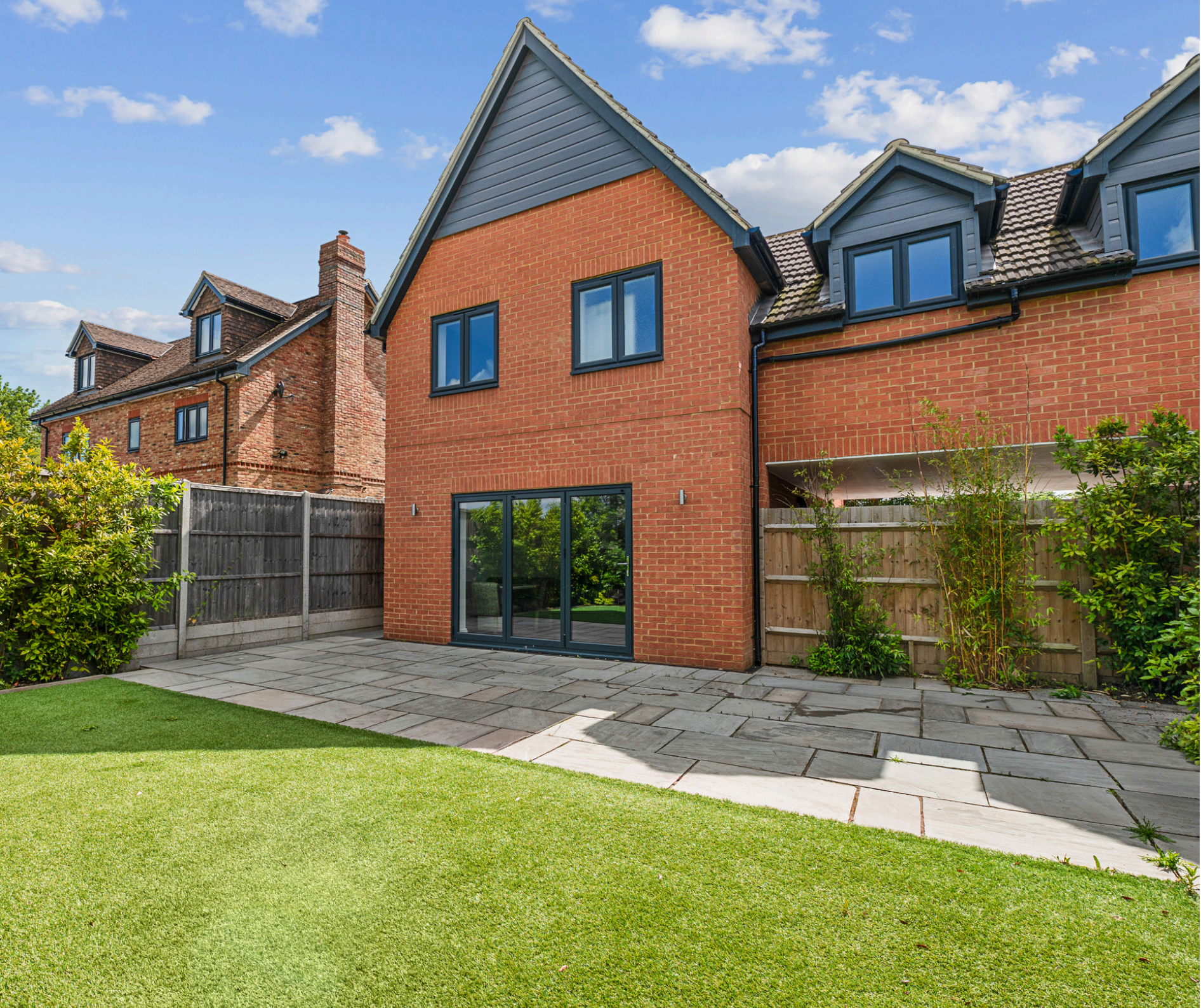
BAY TREES, SINDLESHAM, WOKINGHAM