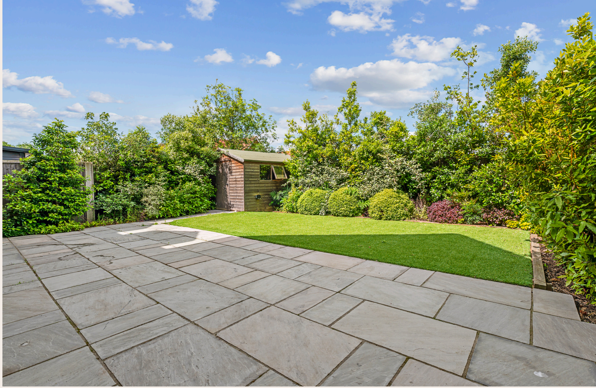
BAY TREES, SINDLESHAM, WOKINGHAM