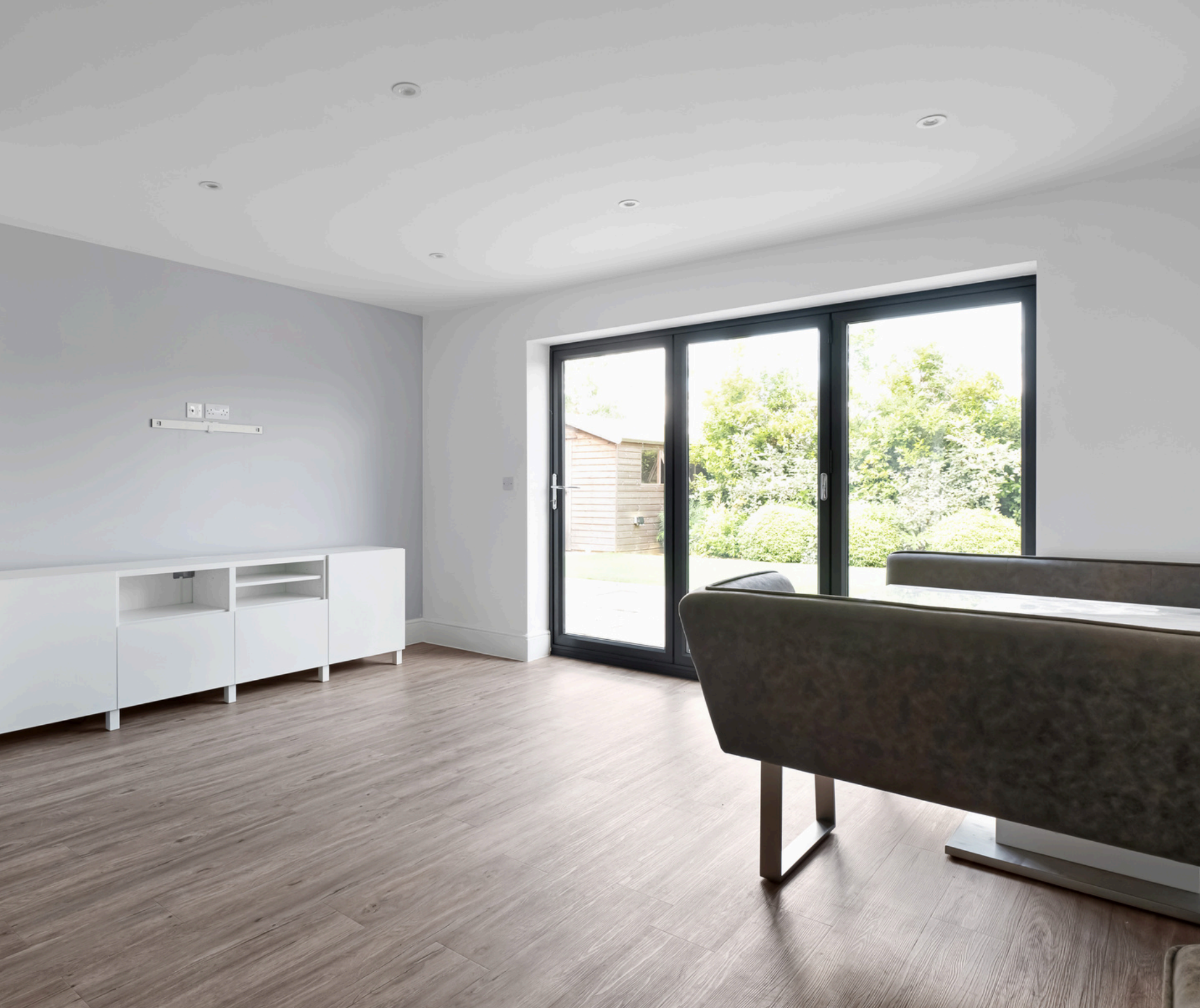
BAY TREES, SINDLESHAM, WOKINGHAM