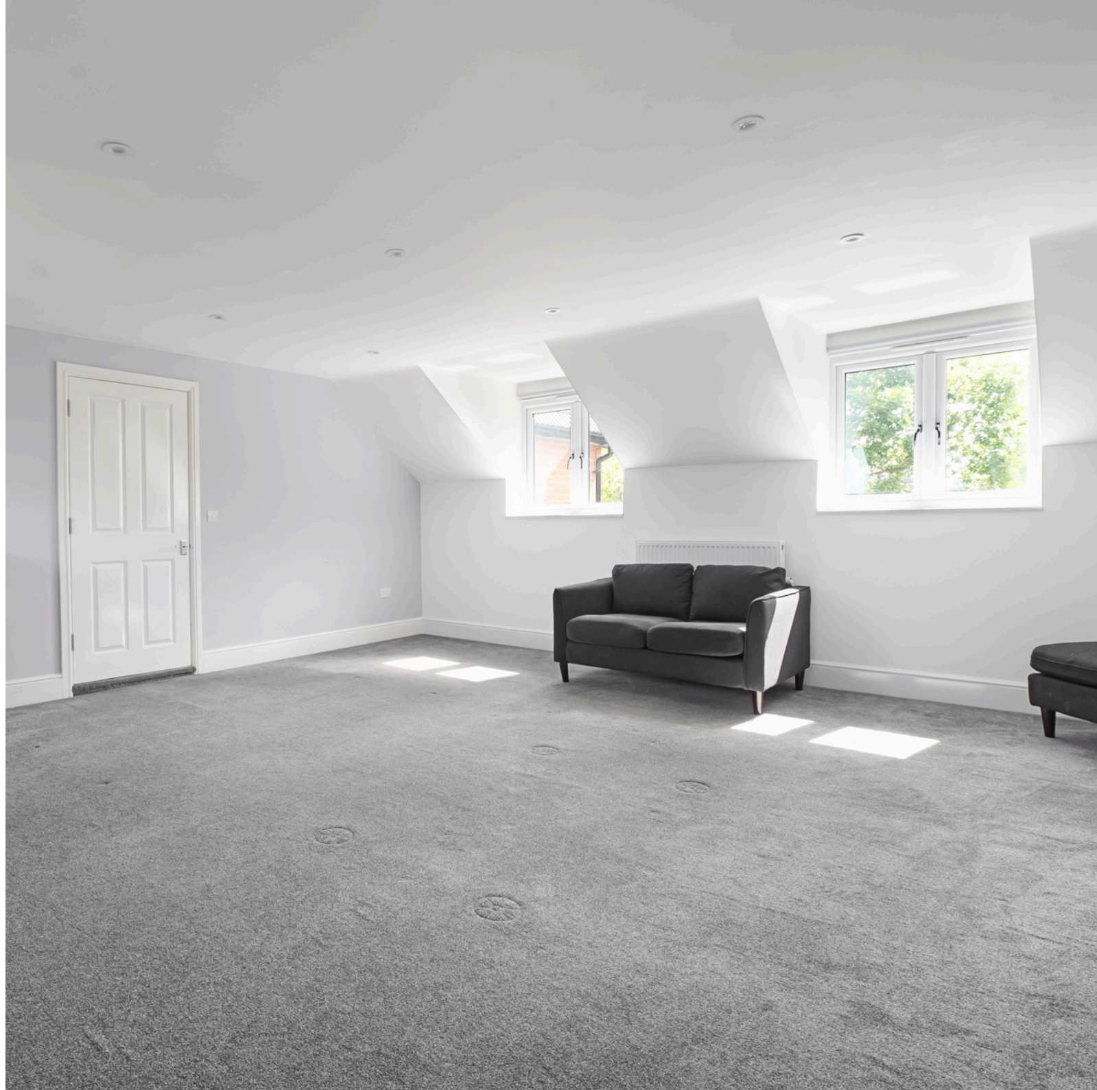
BAY TREES, SINDLESHAM, WOKINGHAM