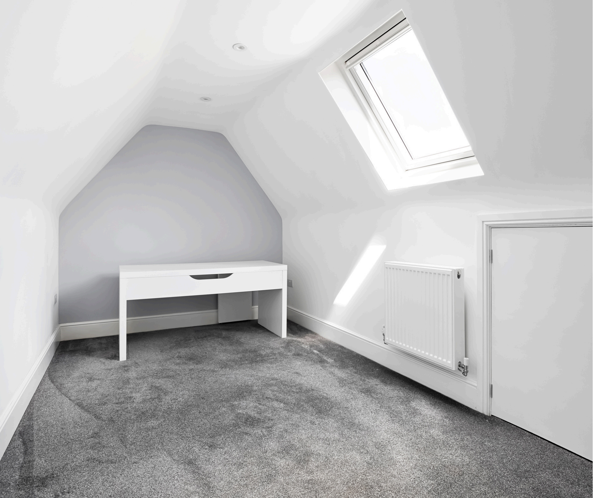
BAY TREES, SINDLESHAM, WOKINGHAM