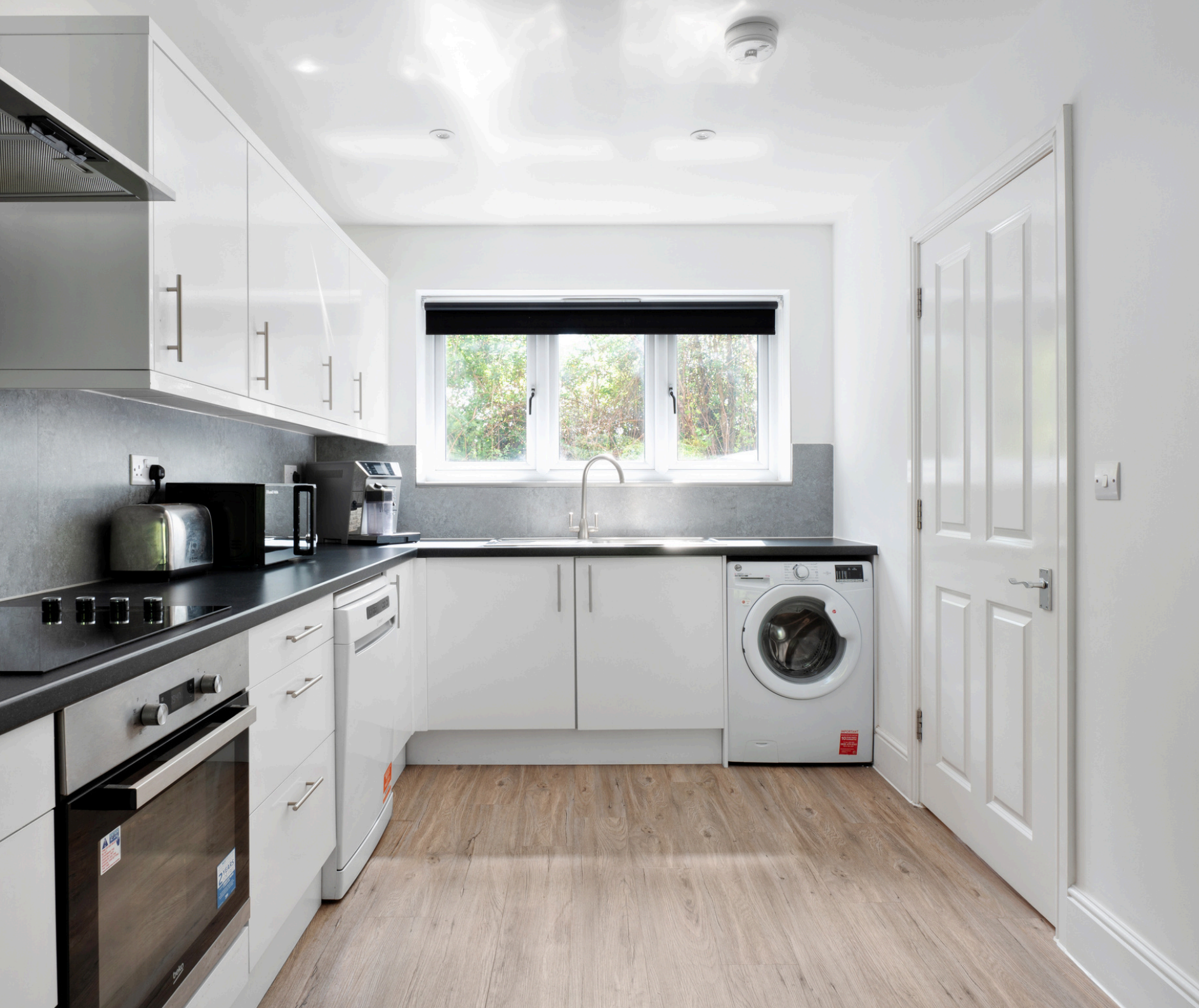
BAY TREES, SINDLESHAM, WOKINGHAM