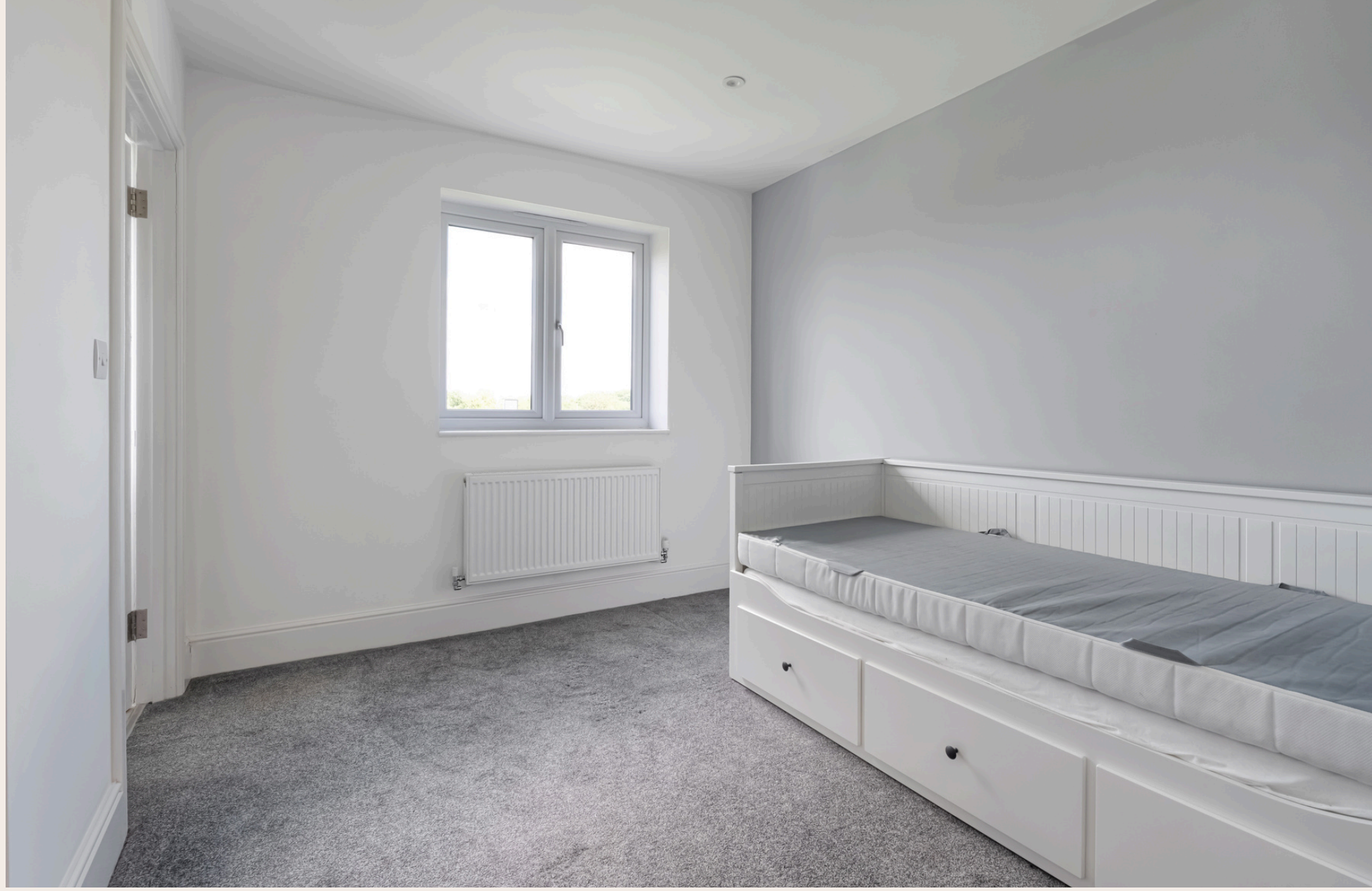
BAY TREES, SINDLESHAM, WOKINGHAM