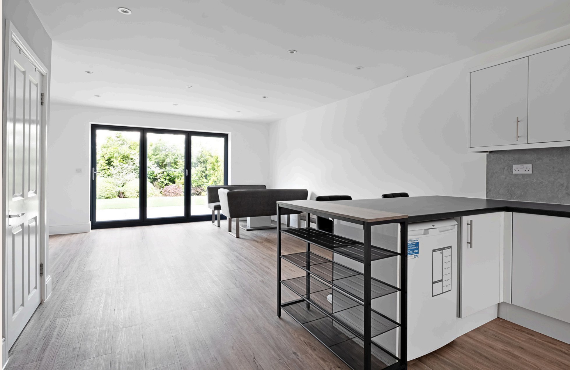
BAY TREES, SINDLESHAM, WOKINGHAM