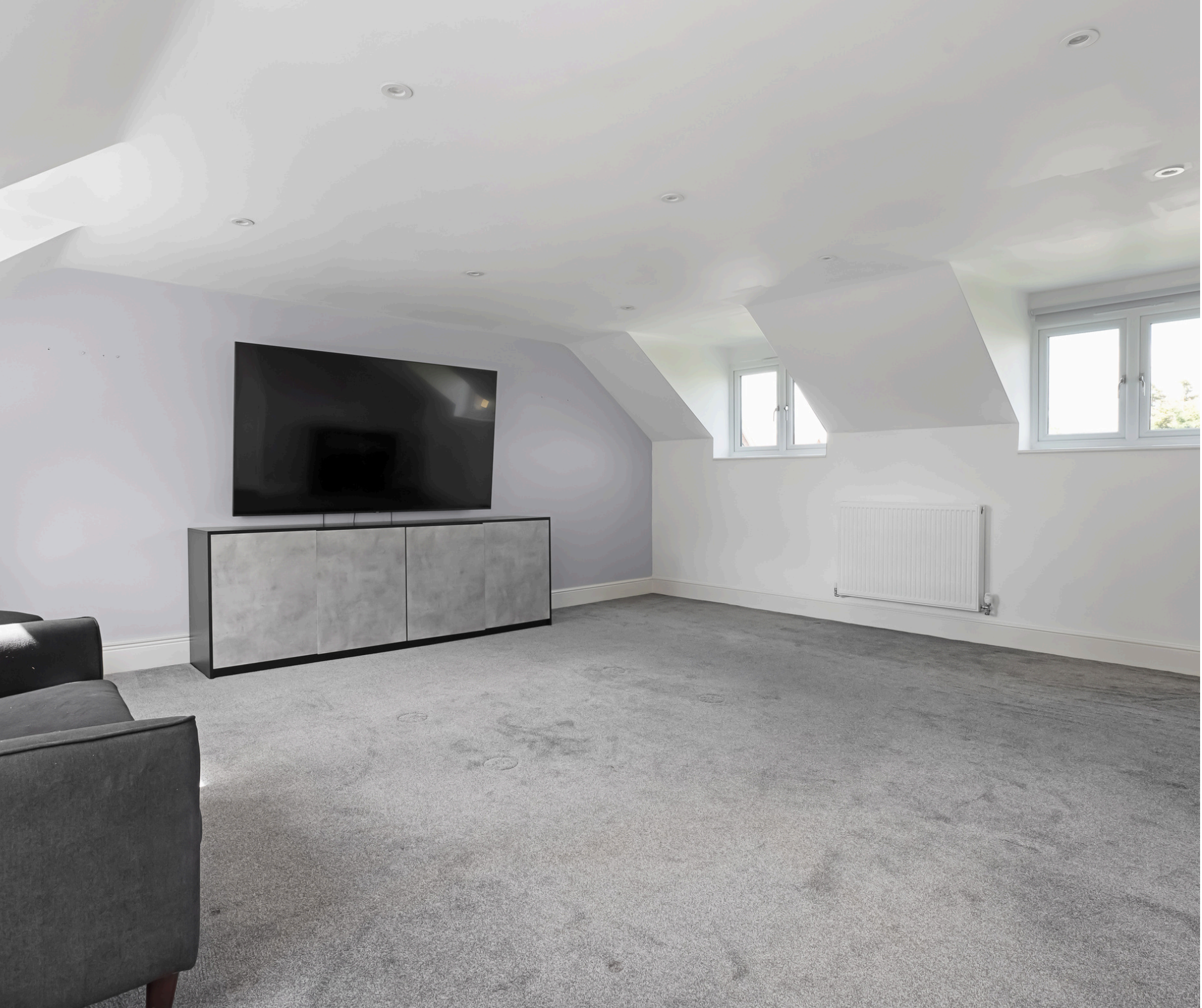
BAY TREES, SINDLESHAM, WOKINGHAM