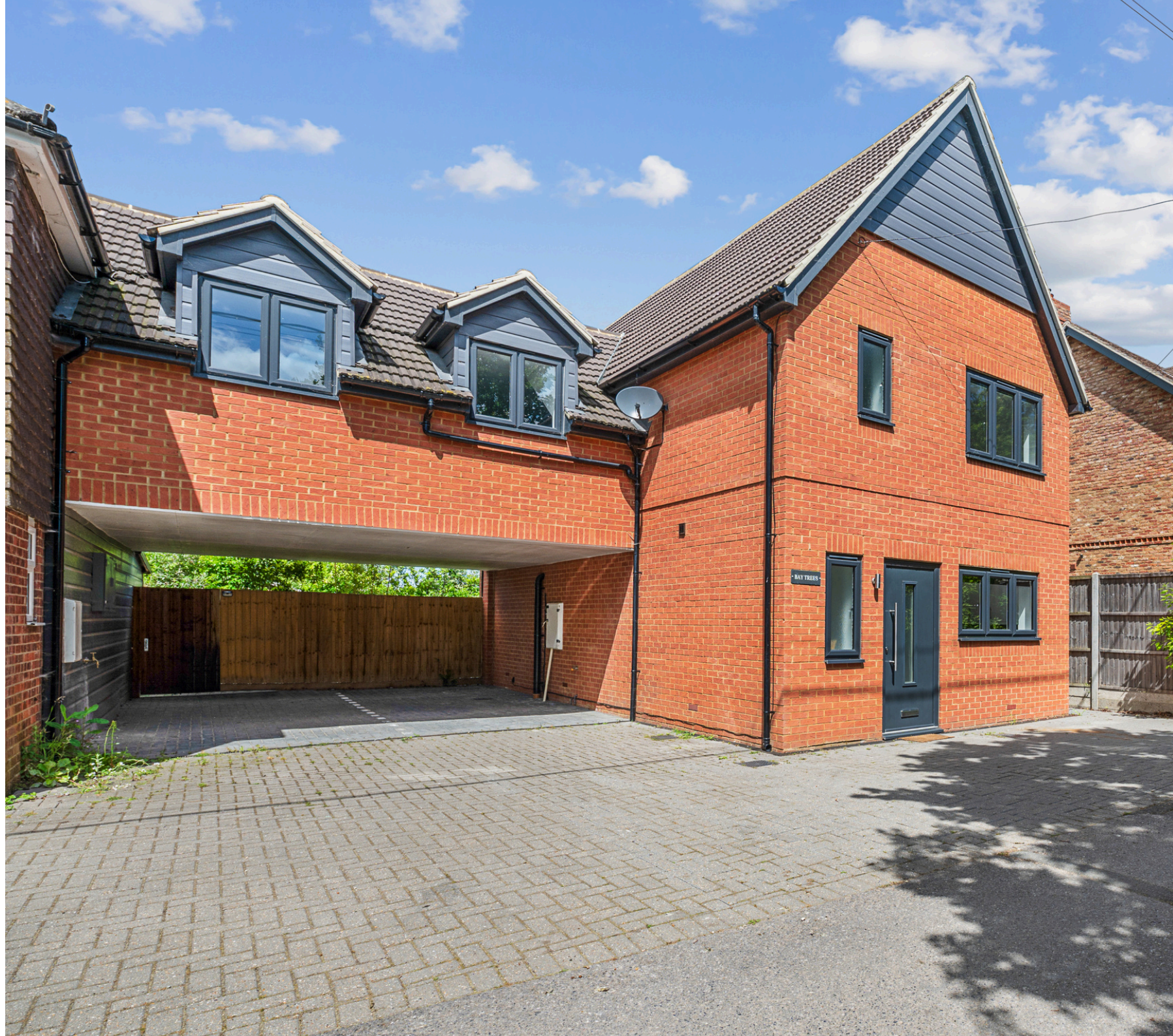
BAY TREES, SINDLESHAM, WOKINGHAM