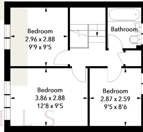
Illustration For Identification Purposes Only. All measurements and areas are approximate, not to scale.