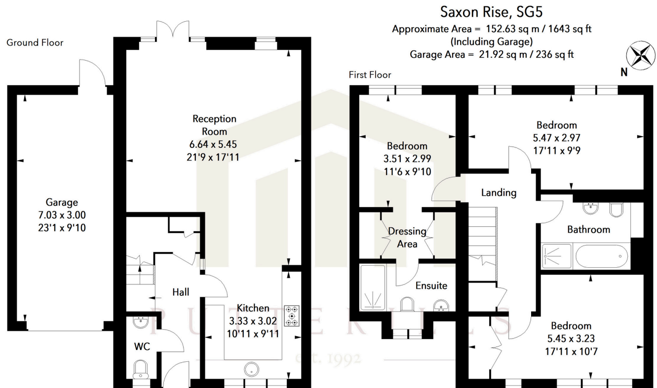
Illustration For Identification Purposes Only. All measurements and areas are approximate, not to scale.