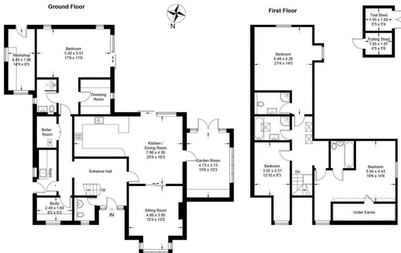
Hillbrow, Church Green Approximate Gross Internal Area = 220.4 sq m / 2372 sq ft