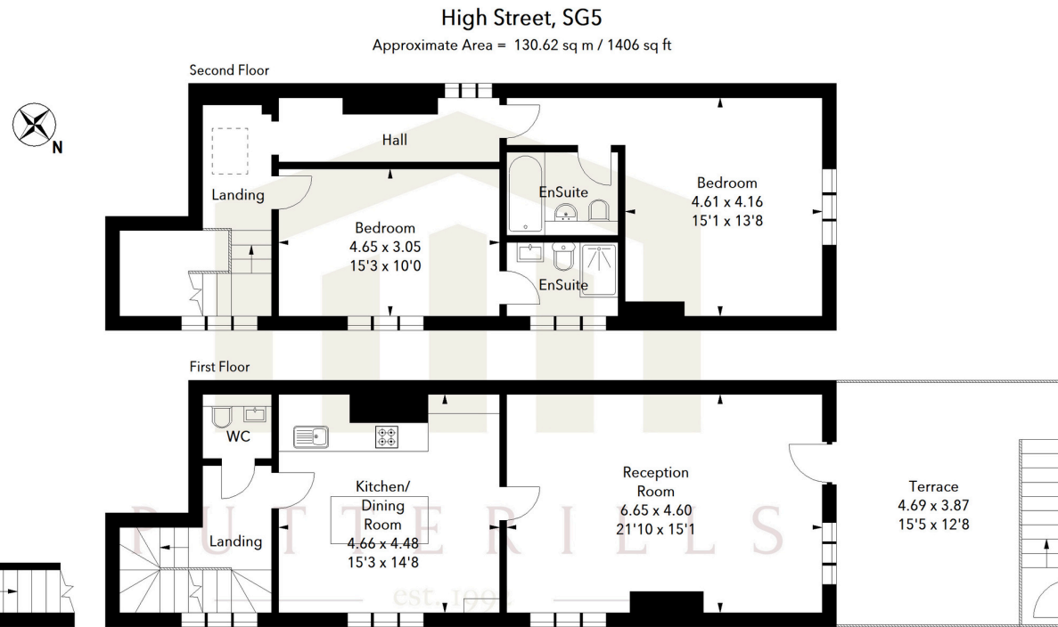
Illustration For Identification Purposes Only. All measurements and areas are approximate, not to scale.