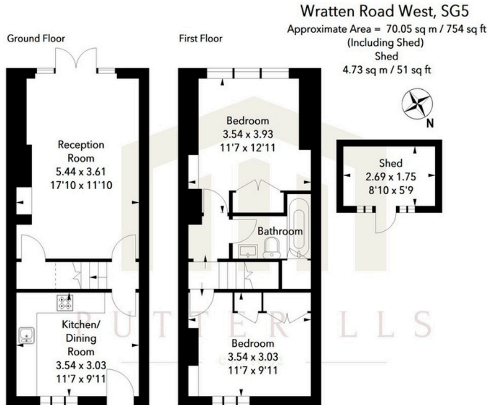
Illustration For Identification Purposes Only. All measurements and areas are approximate, not to scale.